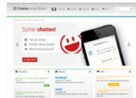
Chatten ohne Risiko