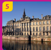
Palais Rohan 2 Place du Château