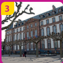
Hôtel de Ville 9 Rue Brûlée