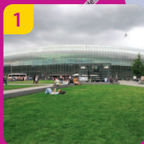
Gare Place de la Gare