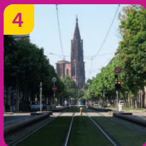
Cathédrale Place de la Cathédrale