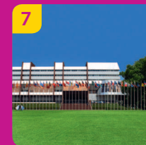
Council of Europe Avenue de l'Europe