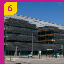
Maison de la Région Grand Est 1 place Adrien Zeller