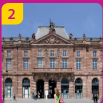
Aubette 31 place Kléber