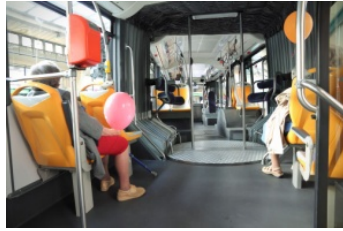
by bus, tram, metro