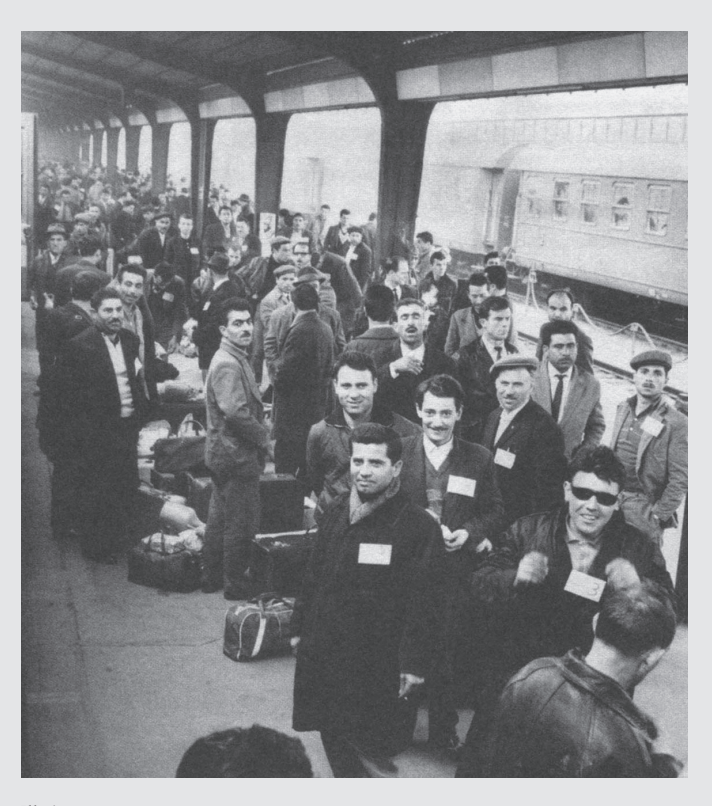
III. 4 Arrival of immigrant workers in Vienna, April 1964.

Ill. 3 (from Roma Rights 1/2004, p. 8ff.)