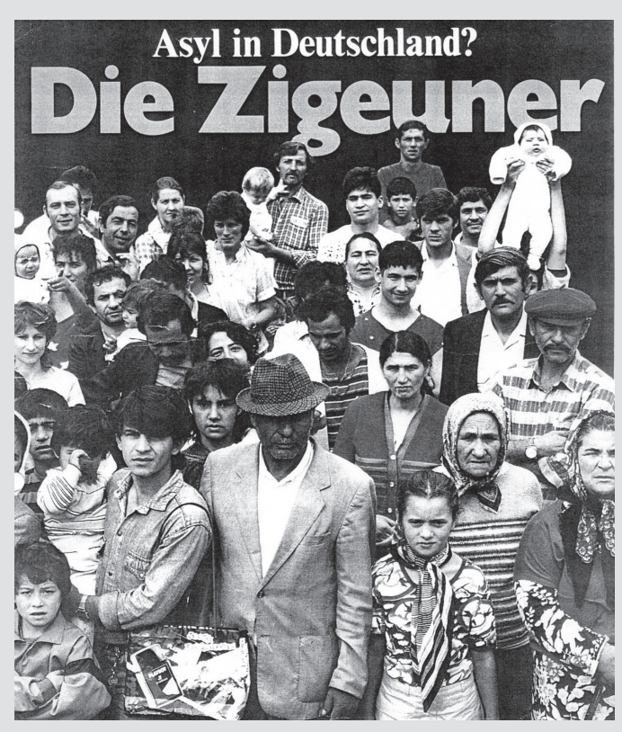
III. 10 Frontpage of the German news magazine "Der Spiegel" on September 3, 1990. It reads: "Asyl in Deutschland? Die Zigeuner" ("Asylum in Germany? The Gypsies").