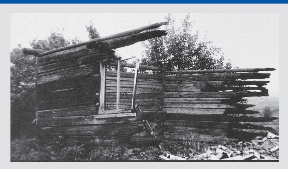
III. 6 A Romani house in Plăieșii de Sus shortly after the outbreak of violence of June 1991. (from Haller 1998, p. 38)

"In Plăieșii de Sus, Harghita County, a town with 3,200 inhabitants, 200 of whom are Roma, villagers burned 28 houses and killed a Romani man on June 9, 1991. The sequence of events began on June 6, 1991, when four Romani men beat Ignác Daró, a night guard, because he interfered as they beat their horse. Shortly after the incident, the crowd beat two innocent old Romani men out of revenge. One of them, Mr Ádám Kalányos, later died of the injuries he had sustained. In the meantime the police arrested the four Romani men. Two days later a warning sign appeared on the outskirts of the settlement where the houses of the Roma families stood, informing the inhabitants that on June 9, Sunday evening, their houses would be set on fire. The Roma informed both the police and the vil-