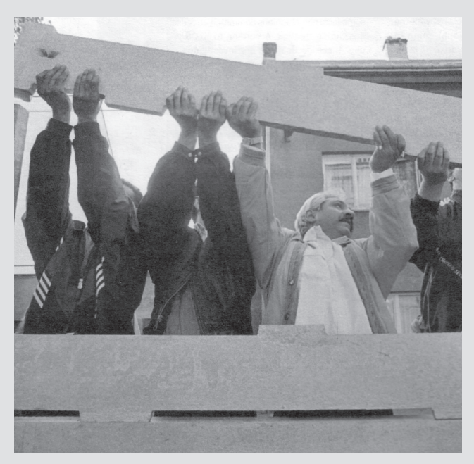
III. 14 In Czech Usti Nad Labem the major had a 65 m long and 1.8 m high wall erected between the houses of Roma and non-Roma in October, 1999; the picture shows the dismantling of the wall in the same month, because of international protest.