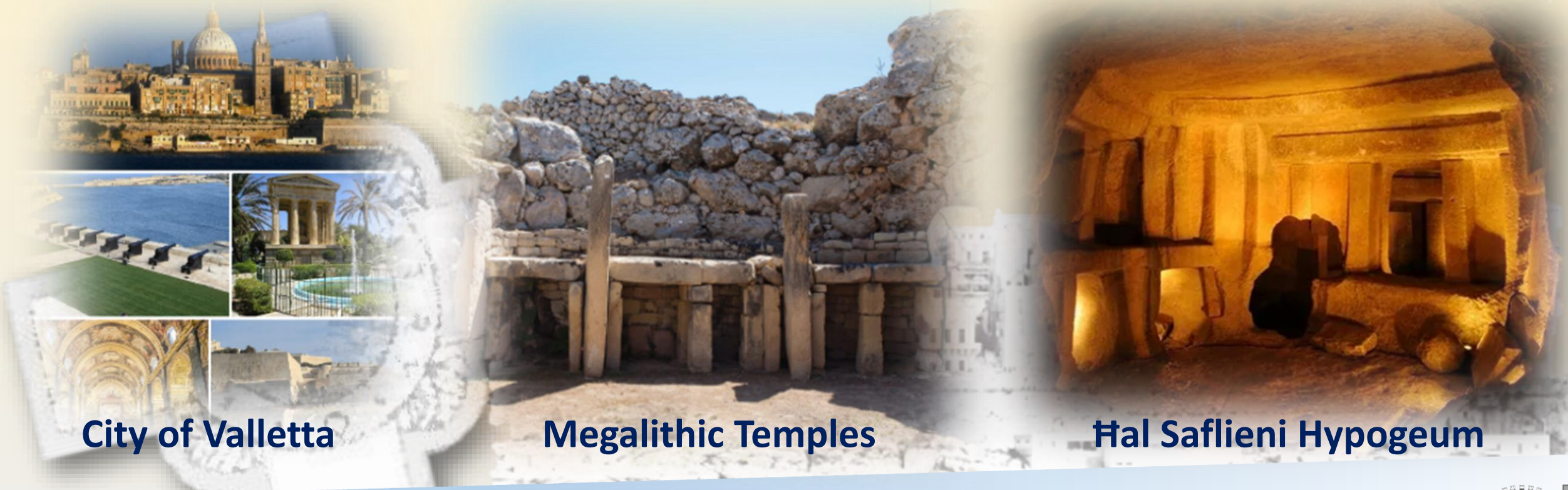
City of Valletta