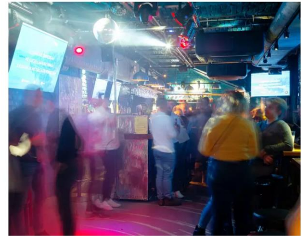
Karaoke soi Erottajan baarissa.

Faron sopimuksen mukaan kulttuuriperinnön kunnioittaminen suojelee yhteiskuntien vakautta.