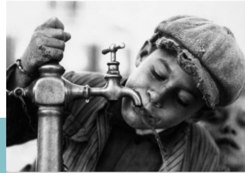
DEVELOPMENT THE UNDERSTANDING OF COMPLEXITY

The [PeP] project embodies the principles of the Faro Convention, connecting people and communities to their heritage: