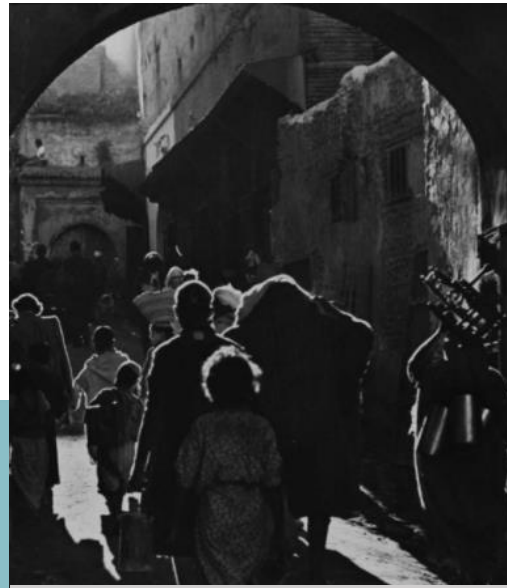
SOCIETY TOGETHER WE MAKE SENSE