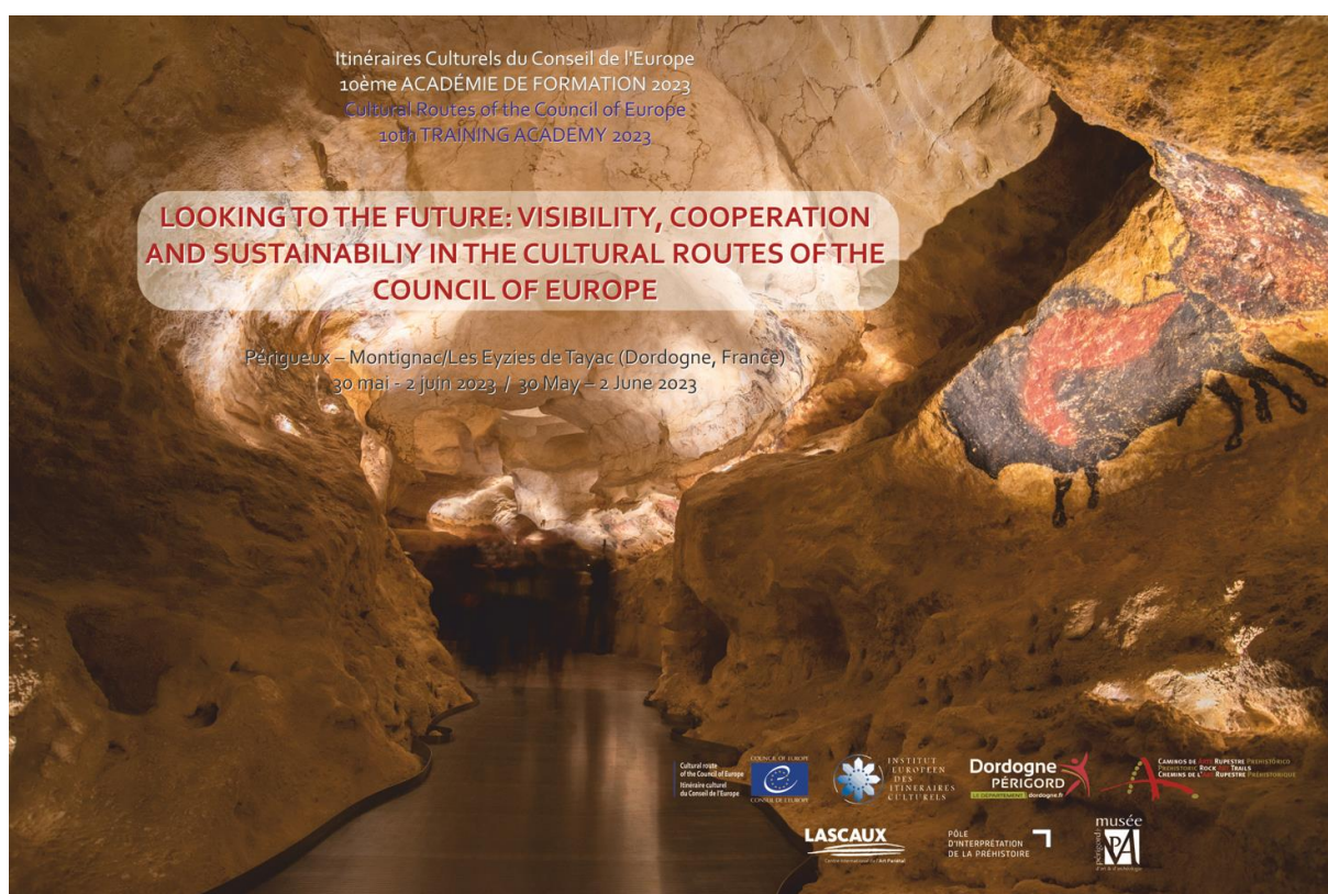
Venue of CIAP-Lascaux (Montignac-Dordogne)

Périgueux – Les Eyzies de Tayac/Montignac (Dordogne, France) 30 May – 2 June 2023