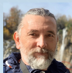
Davor Schunk / FACTSHEET LAYOUT AND DESIGN, ILLUSTRATION