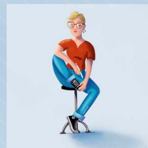
Krešimir Krnic / FACTSHEET LAYOUT AND DESIGN