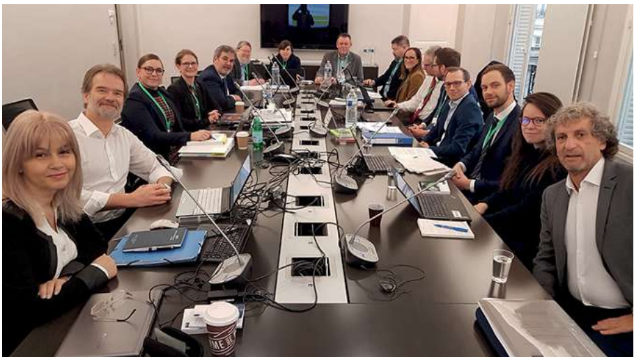
Data protection subgroup, Paris, February 2020: the last physical meeting before Covid-19 restrictions set in