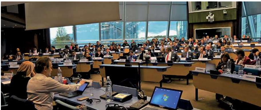
Protocol Drafting Plenary, Strasbourg, November 2019

In total, over 620 representatives from 75 States and eight observer organisations contributed to the preparation of the Protocol over a period of almost four years.