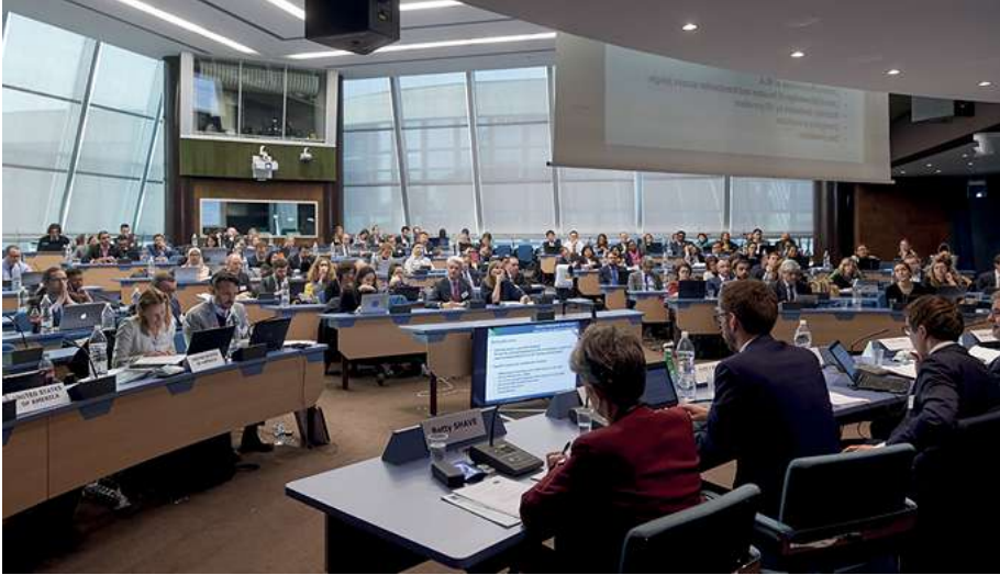
Octopus Conference 2019: Consultations with stakeholders