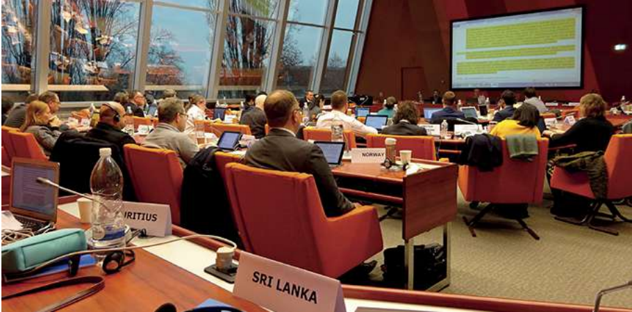
Protocol Drafting Group, Strasbourg, January 2020

Organization for Security and Co-operation in Europe (OSCE), the Southeast European Law Enforcement Center (SELEC) and the United Nations Office on Drugs and Crime. Furthermore, numerous civil society and industry organisations as well as data protection experts provided their contributions in six rounds of stakeholder consultations.