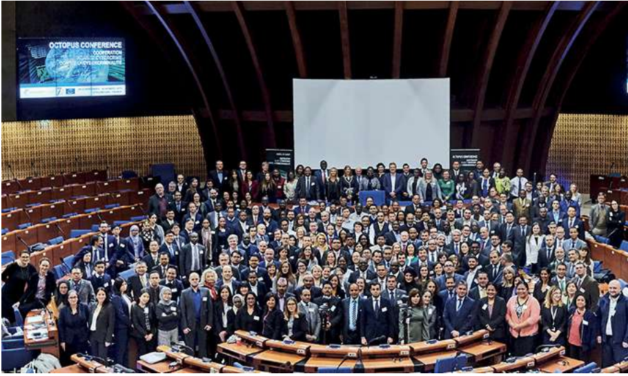
Octopus Conference 2019