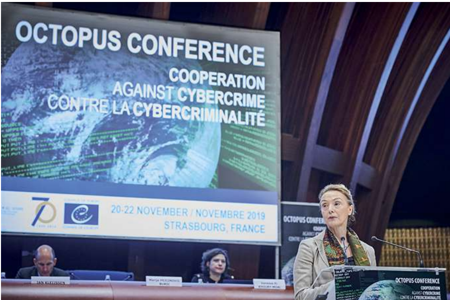
Octopus Conference 2019: Council of Europe Secretary General Marija Pejčinović Burić