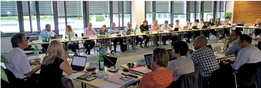
Protocol Drafting Group, Vienna, 2018

During the last twelve months of negotiations, all meetings were held online due to the Covid-19 pandemic.