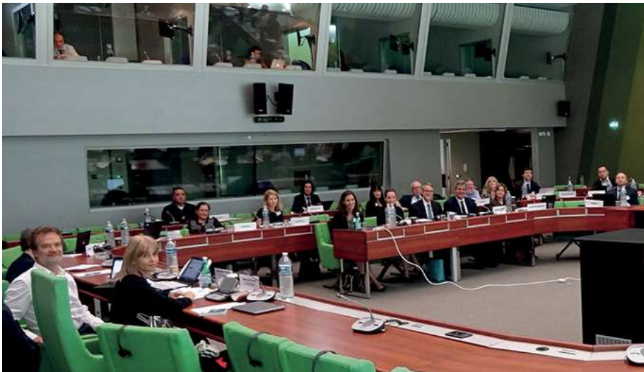
First meeting of the Protocol Drafting Group, Strasbourg, September 2017