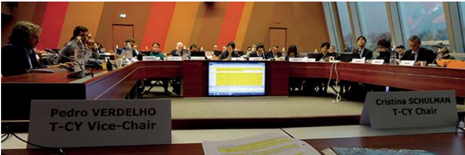
Protocol Drafting Group, Strasbourg, January 2020