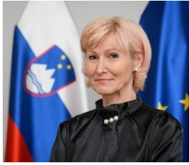
Mag. Lilijana Kozlovič , Minister of Justice of Slovenia

After her first law degree obtained in 1997 from the faculty of Ljubljana. She went on to gain a master's degree in law in 2012 from the same faculty. Mag. Lilijana Kozlovič started her career in 1981 at the Koper Police Directorate under the Ministry of Interior and pursued her academic career at the Faculty of Law in Ljubljana. In 1997, she became the head of the Civil Registry, Migrations and Public Order Division and later the head of the Internal Administrative Affairs Division. After taking the helm of the Slovenian Environment Agency as Acting Director-General in June 2019, she was appointed Director-General in December 2019.