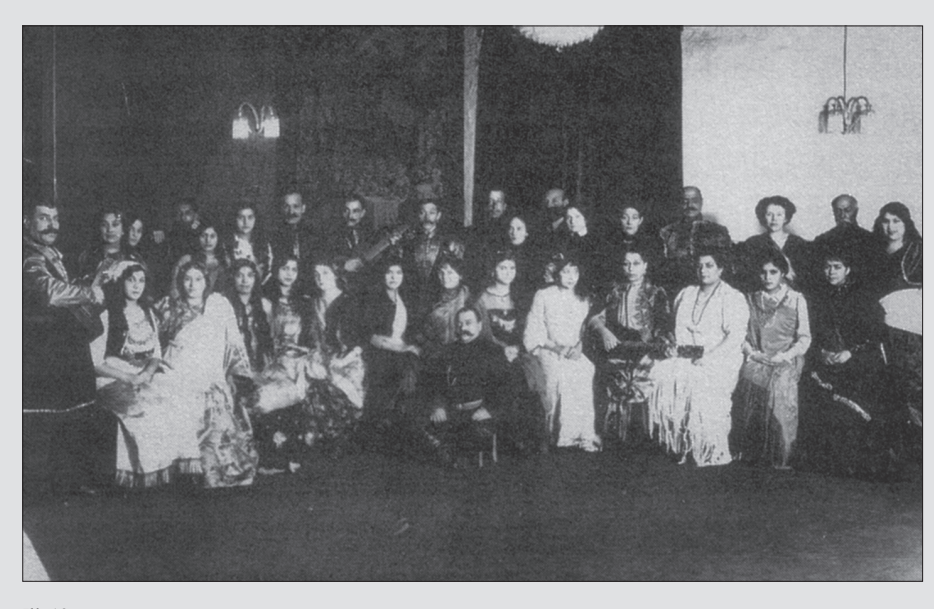
III. 12 Pre-revolutionary "Gypsy"-choir. (from Lemon, Alaina (2000) Between two Fires. Durham / London: Duke University Press, p. 45)

The first complete "Gypsy" performances by "Gypsy" musicians and actors were staged towards the end of the 19th century. On March 20, 1888, the musical comedy "Chave adro vesha" (Children in the forest) was performed at the Malyi Theater in St. Petersburg. The music, primarily "Gypsy" songs and romances, was an arrangement by Nikolai Shishkin. The play was continously shown up to 1906. 1892 saw the premiere of N. Shishkin's new operetta "Gypsy Life".