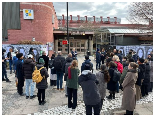
Final event in Sweden