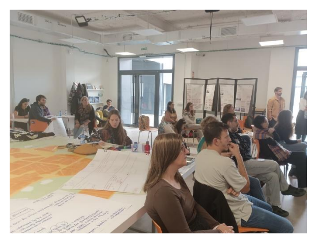
Kick-off meeting, November Fuenlabrada