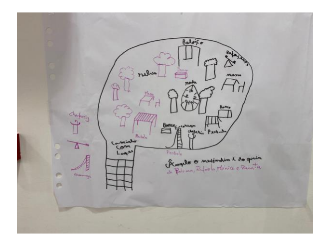
Drawing made by participants of the Assembly

The project ended on the 31st June 2024, and a final event was held in Strasbourg with all partners. During the month of July, the project report was made and provided to the coordinators - ICEI.