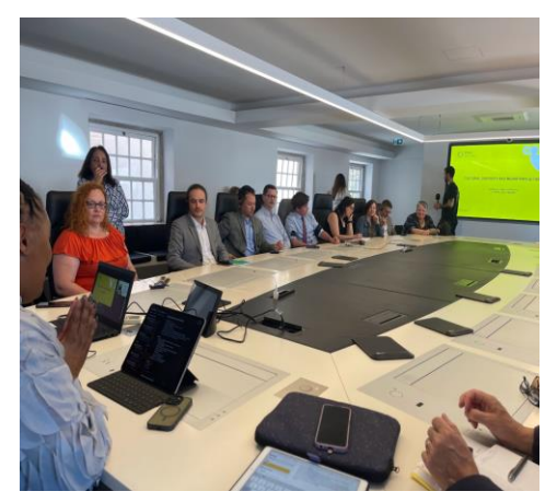
Visit by Finnish cities - Cascais

RPCI coordinator prepared a study visit from 6 Finnish cities to Portugal, to the cities of Loures, Lisboa and Cascais, that was held on the 10th and 11th April, with the presence of 19 people from the CoE, 6 Finnish cities and 3 people from the Finnish Government.