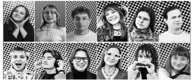
Portraits for the media campaign

<u>Belong</u>" was designed during the event and it is now available on RPCI website. One <u>podcast episode</u> was recorded with interviews of young people that participated in the project.