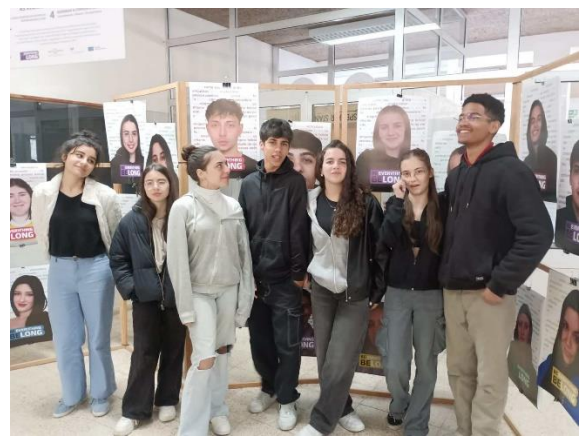
Exhibition in Santa Maria da Feira