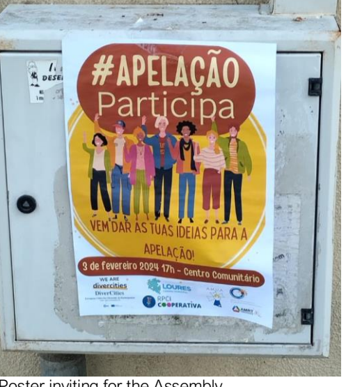
Poster inviting for the Assembly