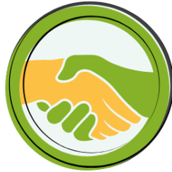
Agreeing on needs and plans