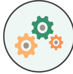
Translating plans into actions and projects