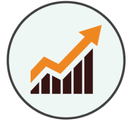
Funding and Project implementation