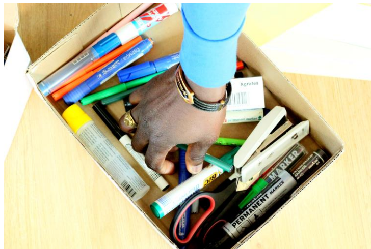
3 rd Training Course for Youth Leaders of the African Diaspora Living in Europe – Braga, Portugal (May, 2012)

The pedagogical team was responsible to further design and implement the methodology of the course. Invited guests and experts provided proposals for reflection in a process based on global education and participant-centred methodologies . The training methodology was based on a number of successful experiences of training for youth workers and youth leaders developed by the North-South Centre of the Council of Europe.