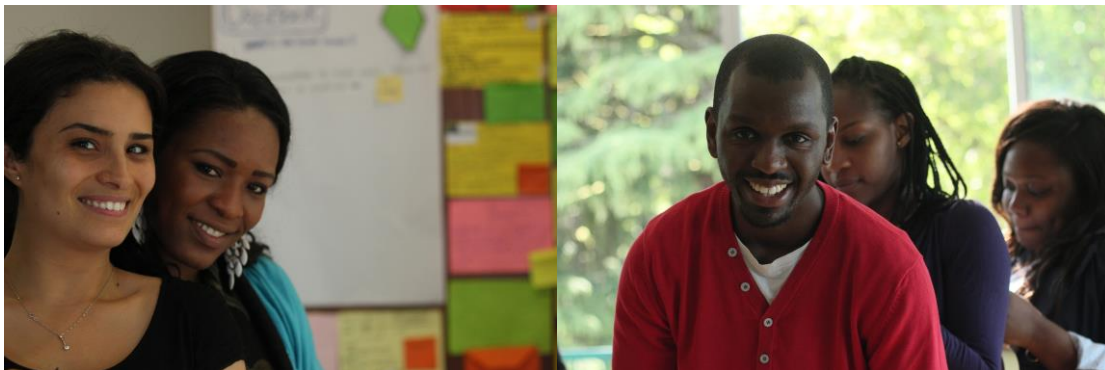
3 rd Training Course for Youth Leaders of the African Diaspora Living in Europe – Braga, Portugal (May, 2012)

The fifth Training Course was organised by the North-South Centre of the Council of Europe in co-operation with the African Diaspora Youth Network in Europe (ADYNE) . The Course was organised in the framework of the 15 th University on Youth and Development, from the 21 st to the 28 th September 2014 .