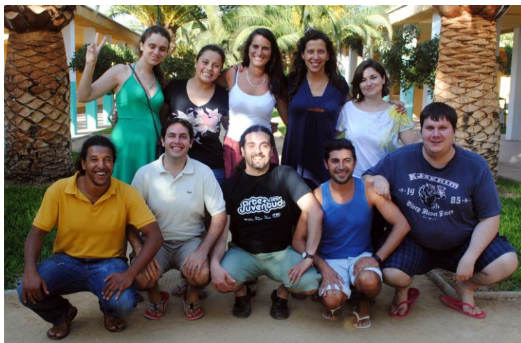
Meeting of the Network of Universities on Youth and Global Citizenship – 13 th University on Youth and Development (2012)

The establishment of this Network is expected to bring added value to the political support and funding of the Universities as well as to strengthen the impact of the work of the Universities and its partners in youth development.