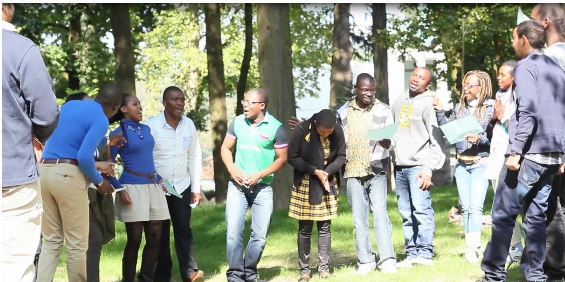
3 rd Training Course for Youth Leaders of the African Diaspora Living in Europe – Braga, Portugal (May, 2012)

Furthermore, the course is a unique moment of practical and political follow-up of the Africa-Europe Youth Co-operation and the outcomes of the 2 nd meeting of the Africa-Europe Youth Platform and the 3 rd Africa-Europe Youth Leaders' Meeting.