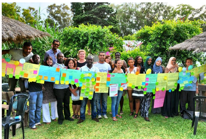
4 th Training Course for Youth Leaders of the African Diaspora Living in Europe – Hammamet, Tunisia (June, 2013)

The African Diaspora Youth Network – ADYNE is a platform of organisations, led and driven by young Africans and young people with African backgrounds living in Europe 1 . It aims and endeavours to serve the interests of young people from all over Europe, promoting their active participation in a constructive dialogue between African and European societies .