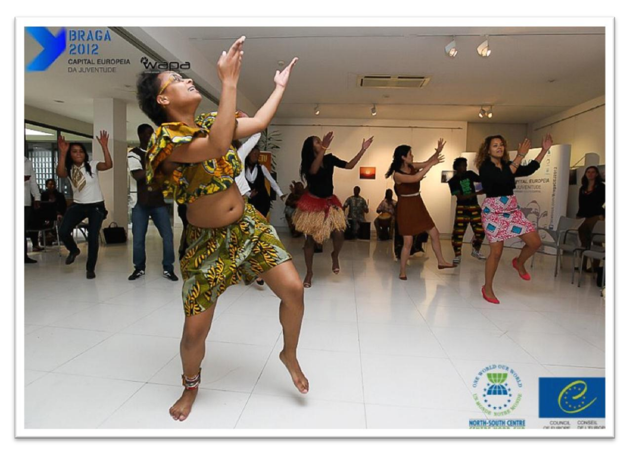
It was very good dancing together for the African day. We had fun together.

4- Premiere of the film "We are like oranges"