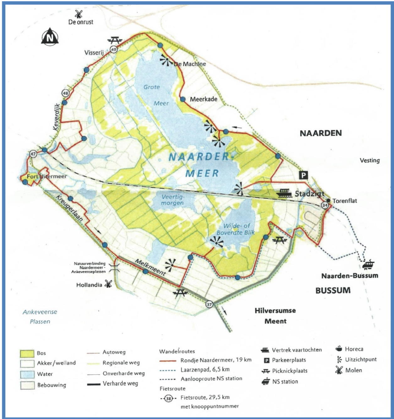
Figure 8 – Map of the Naardermeer Nature Reserve with some of the facilities available to visitors (© Natuurmonumenten)