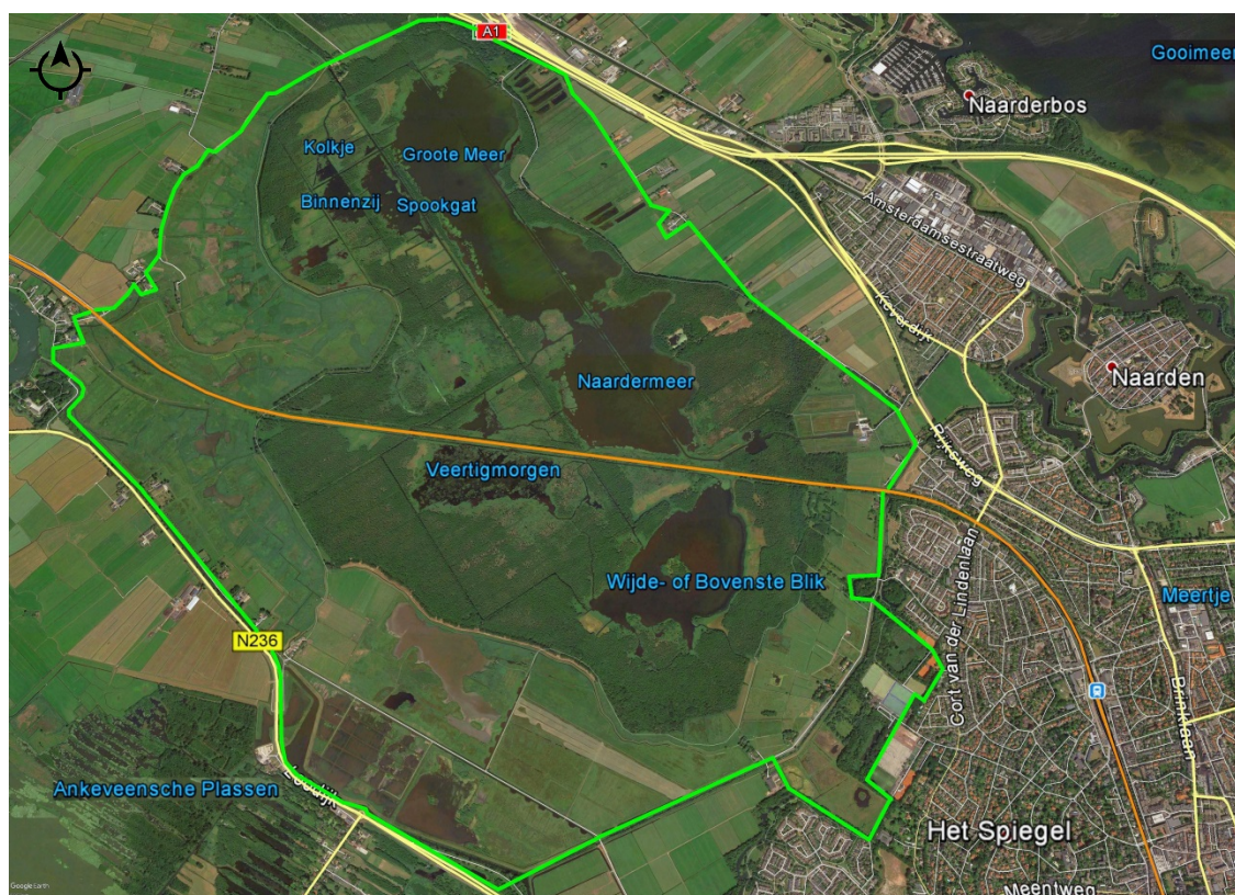
Figure 2. Satellite imagery of the Naardermeer Natural Reserve (GoogleEarth™), showing the limits of the Reserve (light green), the major roads (yellow) namely the A1 at the NE and the N236 at the SW of the Naardermeer NR, and the railway (orange) crossing the Reserve. Lakes are labelled in blue text, localities in white.

The reserve is located in the Noord-Holland region, one of the most densely populated regions of the country. The Naardermeer NR is delimited in the NE by a highway (A1) and in the SW by a national road (N236), and it is crossed by a major railway line (Figure 2). Despite the relevant habitat fragmentation caused by these major transportation routes, the overall awareness and recognition of Naardermeer’s conservation importance allowed the preservation of its core area and the surrounding buffer zone. The recognition of Naardermeer’s importance was in fact fundamental to prevent (or delay) the plans for the A6-A9 motorway connection that required the construction of a new stretch of road in the open polder NW of the reserve. An alternative route was chosen through the existing A1 and A9 highways, albeit implying widening the existing A1, work which is currently ongoing.