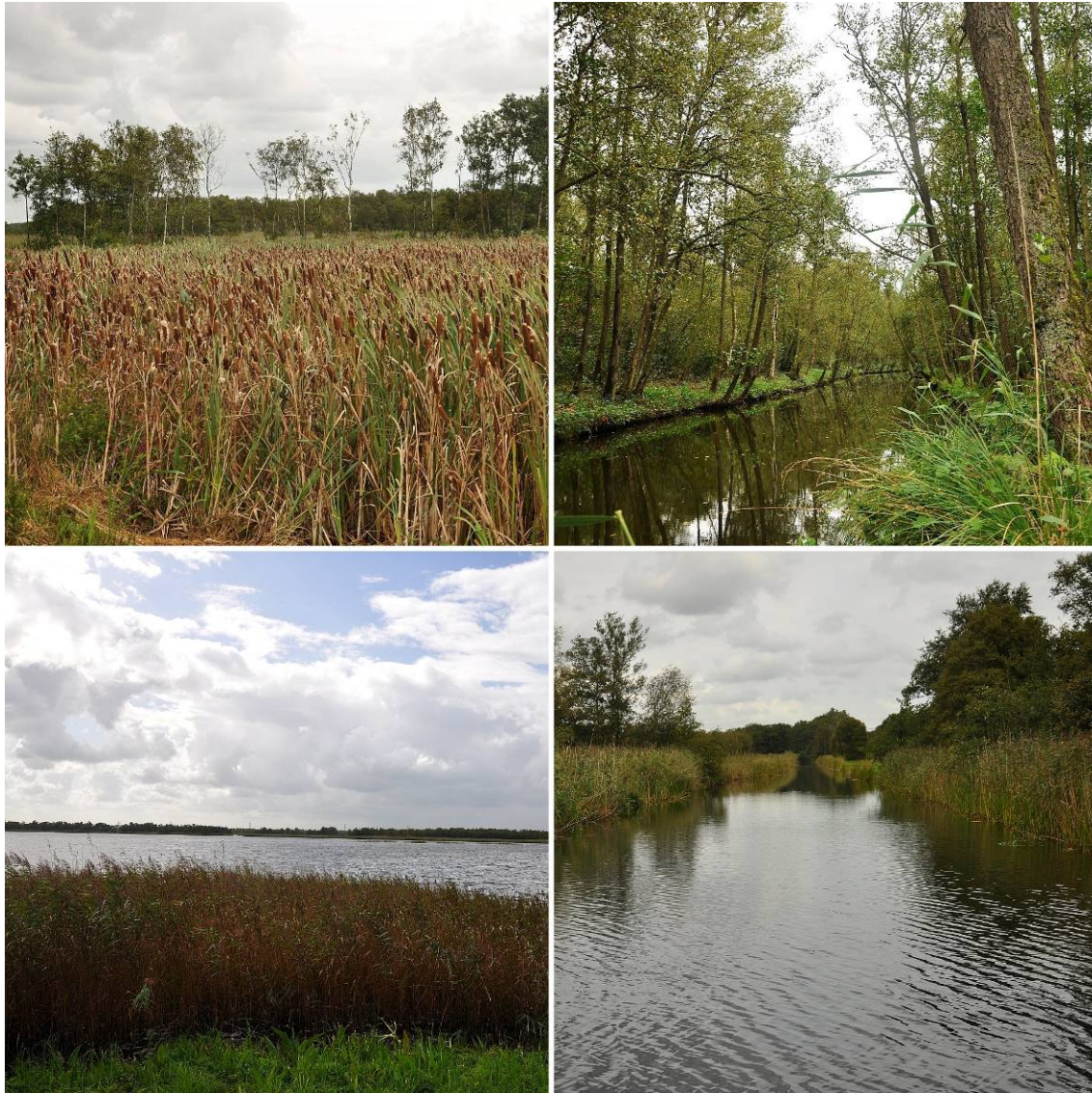
Figure 4 – The lake, channels, marshland and forested areas within the Naardermeer Reserve.

Conclusion: The Naardermeer NR is not a pristine area but there is no doubt of its importance for the conservation of biological diversity at a European level. It comprises breeding sites for species protected under the Bern Convention, it harbours several species protected under the Bird and Habitats Directives and it provides resting and feeding areas for several migratory birds. Surrounding the area of open water we find a mosaic of wet forests, reed banks and peatlands that include several of the habitats protected by the Habitats Directive.