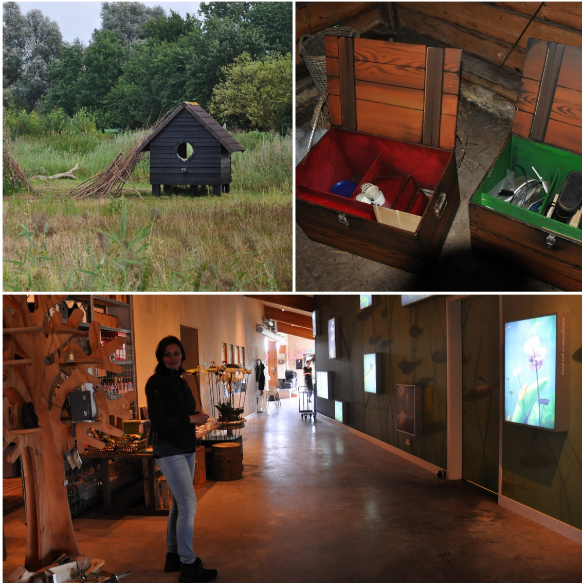
Figure 9 – Some of the infrastructures available to the Naardermeer NR visitors