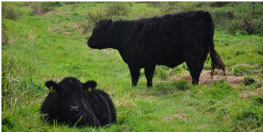
Figure 7 – Galloway cattle used to control the vegetation within the buffer zone of the Naardermeer Reserve.

Within the buffer zone, the vegetation development is controlled by a large herd of Galloway cattle spread in 10 areas (Figure 7). Cattle are managed by the Free Nature Foundation for Restoring European Ecosystems. Other regular management lines are followed, namely cutting woodland and annual clearing of reeds by harvesting, aiming at improving the habitat for reed- and marsh- birds and also stimulating the development of reed and other peat vegetation.