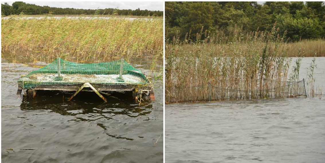
Figure 5 – Some of the direct conservation measures implemented in the Naardermeer NR to counteract some specie's declines: artificial nests for common terns (left), fencing of reeds depriving foraging geese access to the reedbeds (right) and this way improving nesting sites for purple herons.

The continuous monitoring of water quality of the lakes around the Naardermeer (Grote Meer Noord and Zuid, Bovenste Blik and Veertig Morgen, see Figure 2), confirmed the regular occurrence of algae blooms (with an alarming peak in June 2017) and a trend of increasing algal concentration in the lake Bovenste Blik. According to the Regional Water Authority (Waternet) the algae blooms in this lake are the result of eutrophication.