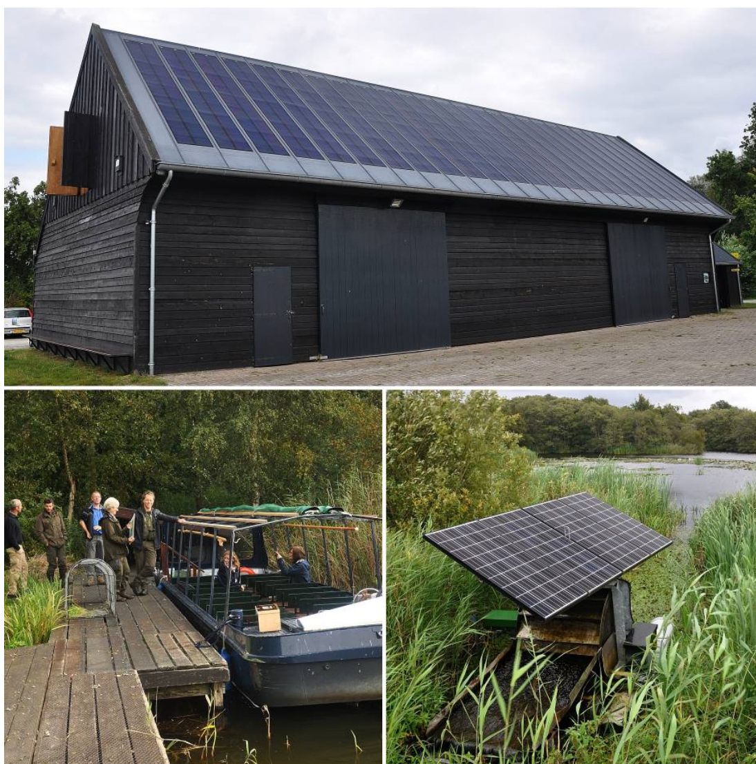
Figure 10 – The use of solar power in the Naardermeer Nature Reserve.

Solar power is the main energy source in the silent electrical boats used in the visits to the Reserve. Some of the wheels controlling the water level between different dykes are also powered with solar panels (Figure 10). It is also worth highlighting the use of wind energy in controlling the Reserve's water level. This task is performed by the windmill de Onrust which, contrary to some others in the region, is kept in perfect working conditions (Figure 6).