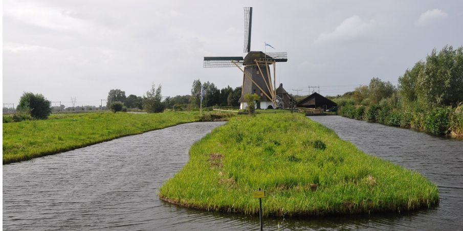
Figure 6 – Windmill de Onrust, a fundamental piece in the water management of the Naardermeer and a good example of the traditional use of wind for water pumping.

Within the buffer zone, the vegetation development is controlled by a large herd of Galloway cattle spread in 10 areas (Figure 7). Cattle are managed by the Free Nature Foundation for Restoring European Ecosystems. Other regular management lines are followed, namely cutting woodland and annual clearing of reeds by harvesting, aiming at improving the habitat for reed- and marsh- birds and also stimulating the development of reed and other peat vegetation.