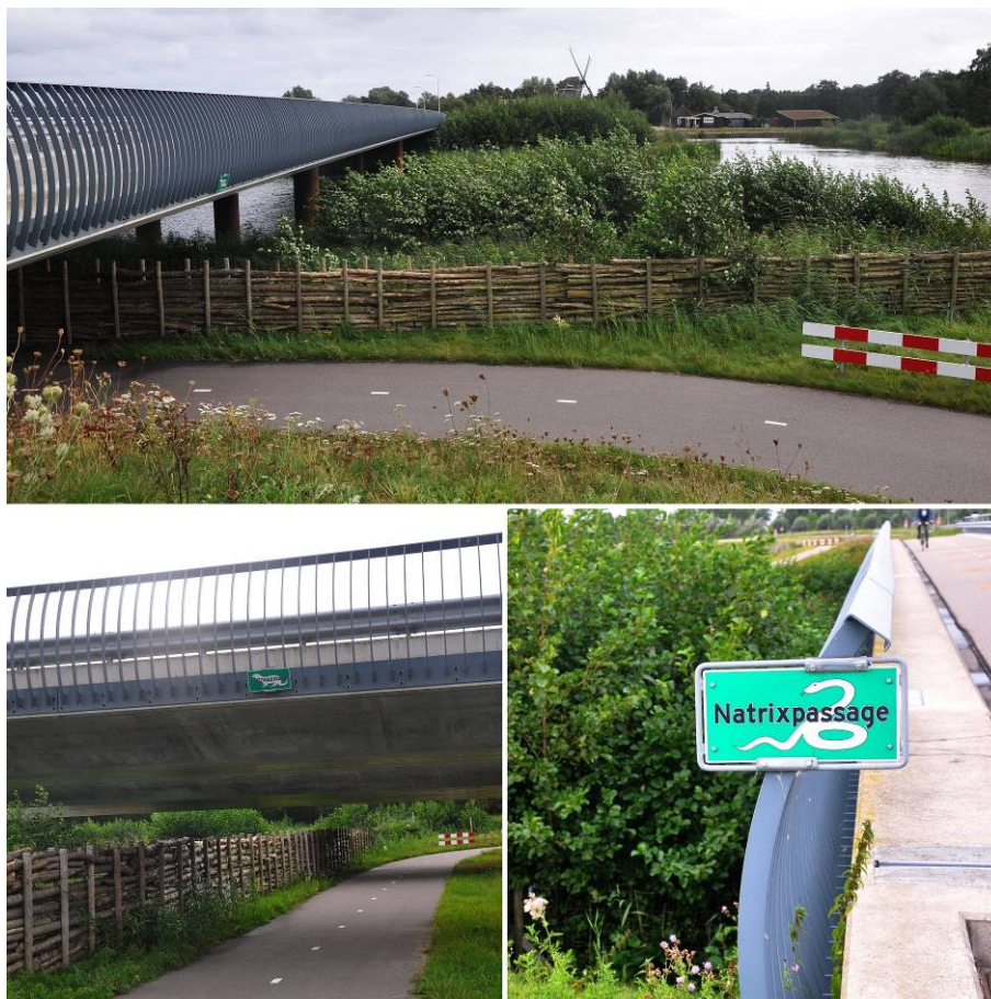
Figure 11 – Ecological wildlife passages under the N236 road that delimits the Naardermeer Nature Reserve on the southwest.

Some efforts were made to mitigate the ecological isolation of the area. Two wildlife passages were already established under the N236 road (Figure 11) and another passage is being implemented under the viaducts in the A1 highway near the junction with the A6. Additionally, and as mentioned in previous annual reports, “ several corridors are under preparation to take away the barrier formed by the railway ”. These are due to be completed by August 2019.