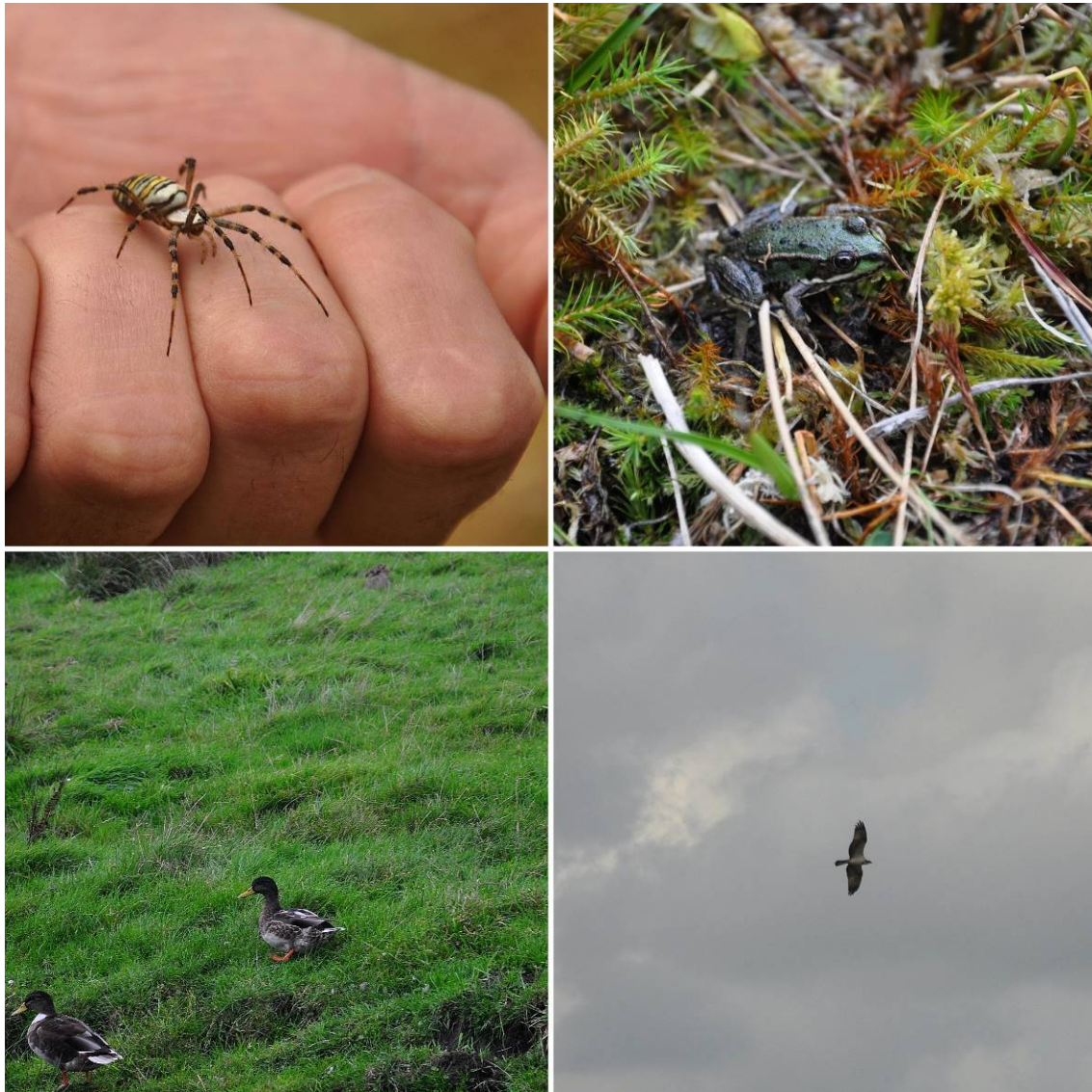
Figure 3 – Some animal species observed during the appraisal visit. Top left: Wasp spider ( Argiope bruennichi ), top right: Marsh frog ( Pelophylax cf. ridibundus ). Bottom left: Mallards ( Anas platyrhynchos ) and a hare ( Lepus europaeus ), bottom right: Osprey ( Pandion haliaetus ).