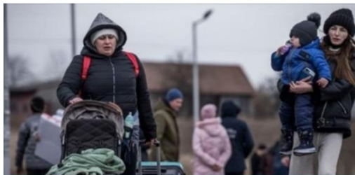
EMERGENZA UCRAINA Raccolta fondi per la prima accoglienza dei profughi al confine con la Polonia