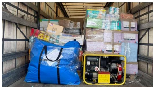
EMERGENZA UCRAINA Fondi destinati all'accoglienza dei profughi al confine con