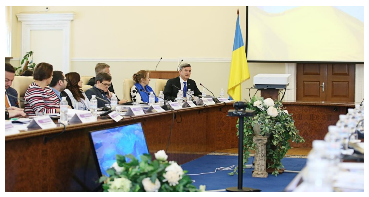
On 25 September 2018, a Congress delegation attended the 5th meeting of the CoR's working group on Ukraine in Kiev.