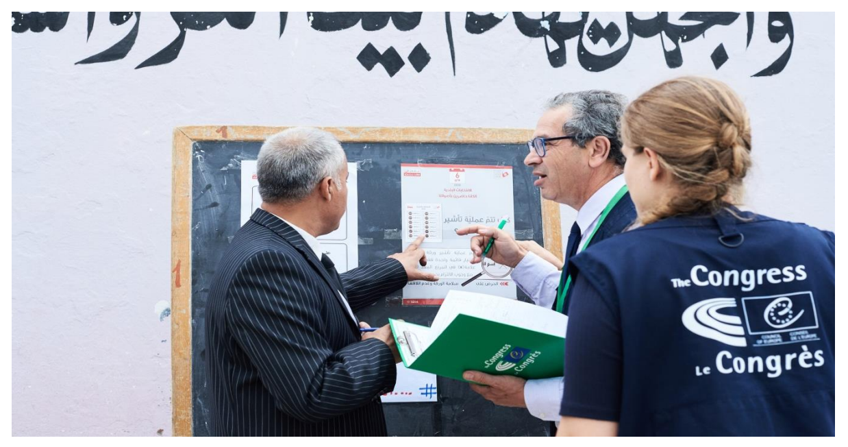
The Congress carried out a mission to observe the municipal elections in Tunisia from 4 to 6 May 2018.

Over the last 15 years, the Congress of Local and Regional Authorities has observed more than 100 local and regional elections in Council of Europe member States and occasionally also beyond. Such missions are conducted further to the invitation of the national authorities or competent electoral bodies and they complement the political monitoring of the European Charter of Local Self-Government. Assistance in following-up to Congress' recommendations prepared further to observation missions can be provided through a post-electoral dialogue.