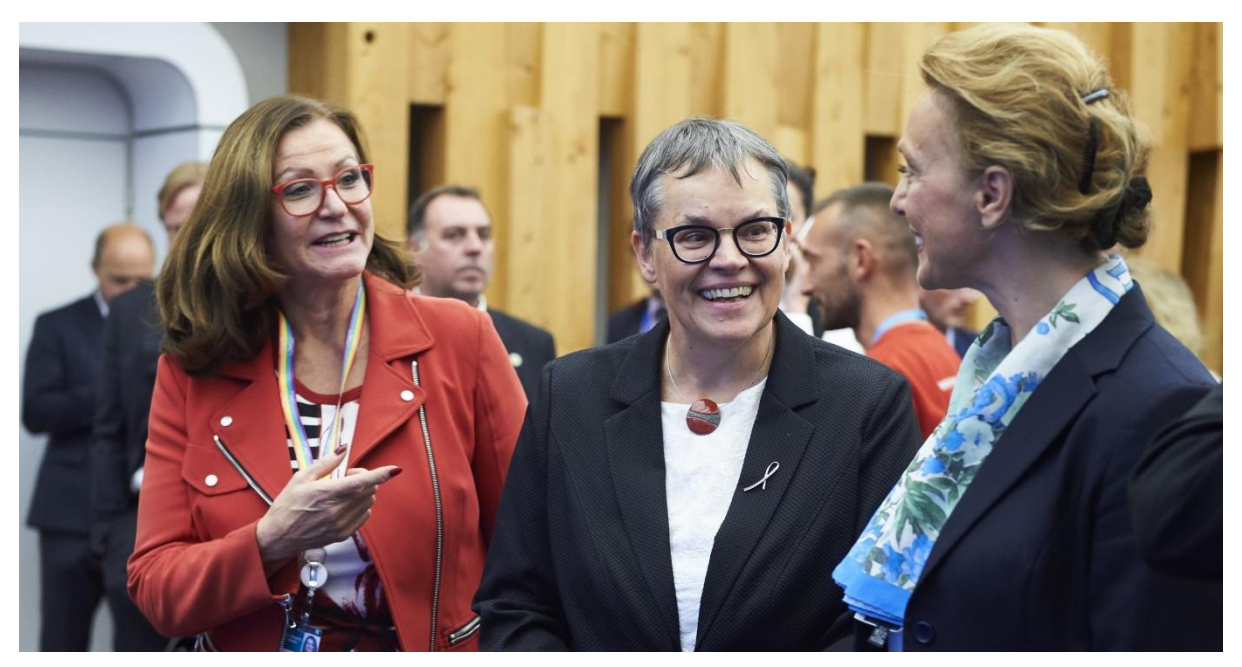
The Presidents of the Committee of Ministers, of the Parliamentary Assembly and of the Congress at the October 2018 Session of the Parliamentary Assembly: Three Women leaders of three political bodies of the Council of Europe – The first time ever in the history of the Organisation.