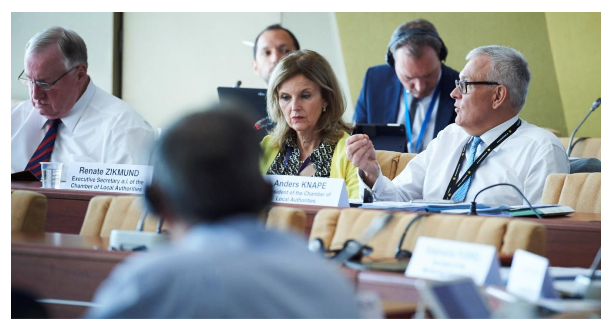
Meeting of the Congress Bureau on 18 June 2018 in Strasbourg.