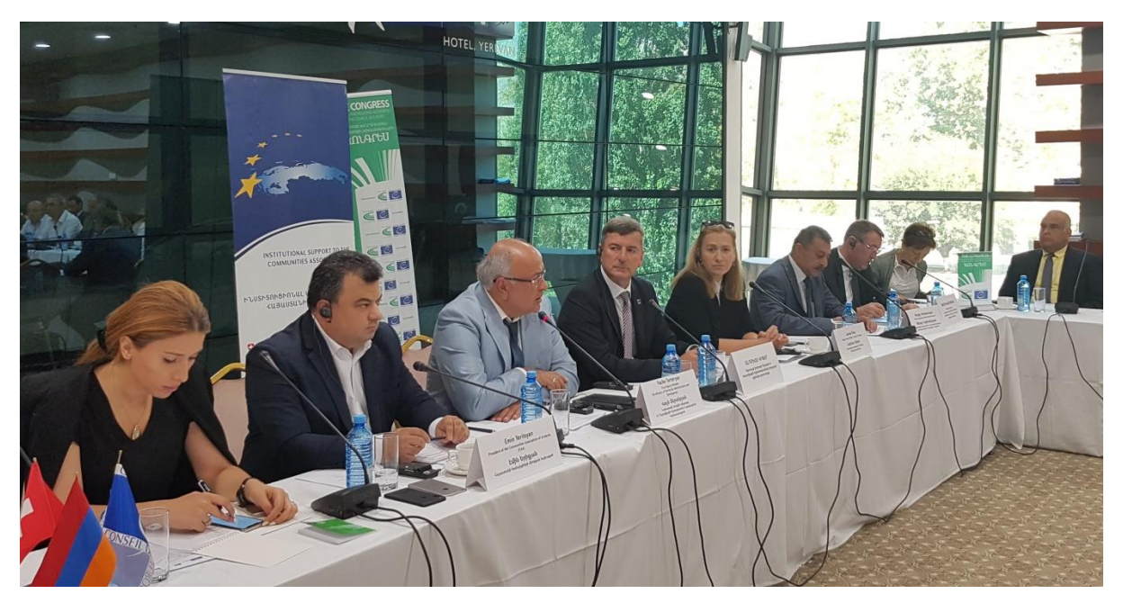
The Congress participated in a workshop on "Consultation mechanisms between local and national authorities", in Yerevan on 12 September 2018.

The Congress' co-operation activities support member States in implementing the recommendations adopted by the Congress to address the problems identified during the monitoring and post-monitoring of the Charter and the observation of local and regional elections.