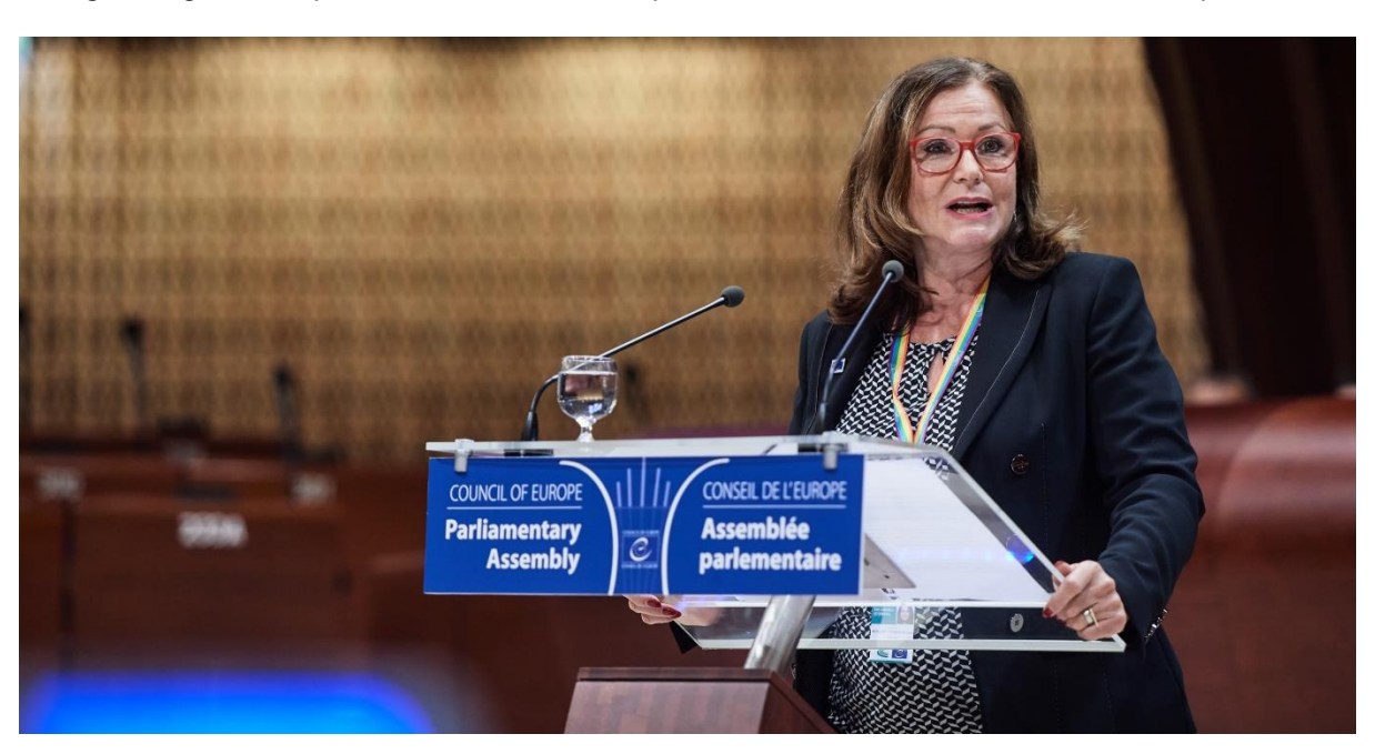
The President of the Congress took part in a debate of the Parliamentary Assembly, on 11 October 2018 in Strasbourg.

also met the PACE President. The two Presidents stressed their willingness to contribute to further strengthening the co-operation between the two political assemblies of the Council of Europe.