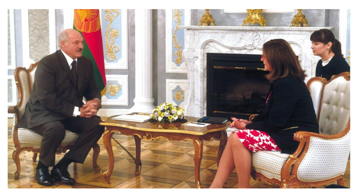
The President of the Congress met the President of the Republic of Belarus Alexander LUKASHENKO on 11 September 2018 in Minsk.