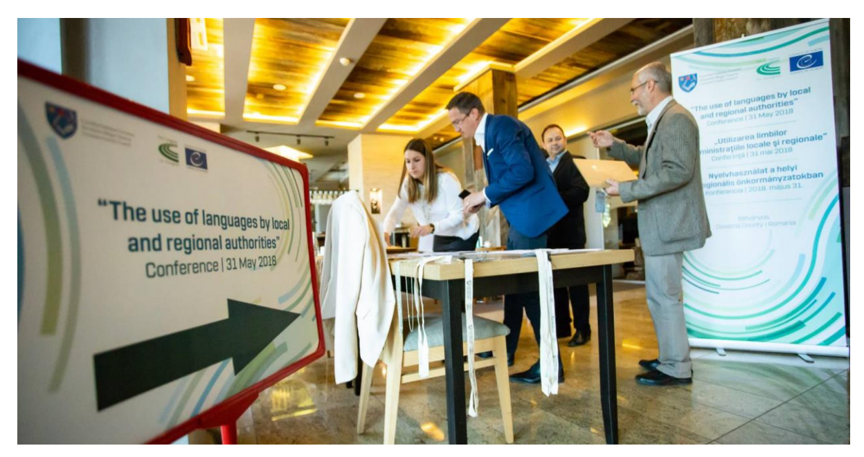
The Congress organised a Conference on the use of languages by local and regional authorities on 31 May 2018 in Romania.

The Congress supports local authorities in the performance of their duties in respect of their citizens and it supports them in their search for solutions to the challenges they face, in particular in terms of security, integration, dialogue and participation, respect for fundamental human and social rights, and the inclusion of vulnerable populations.