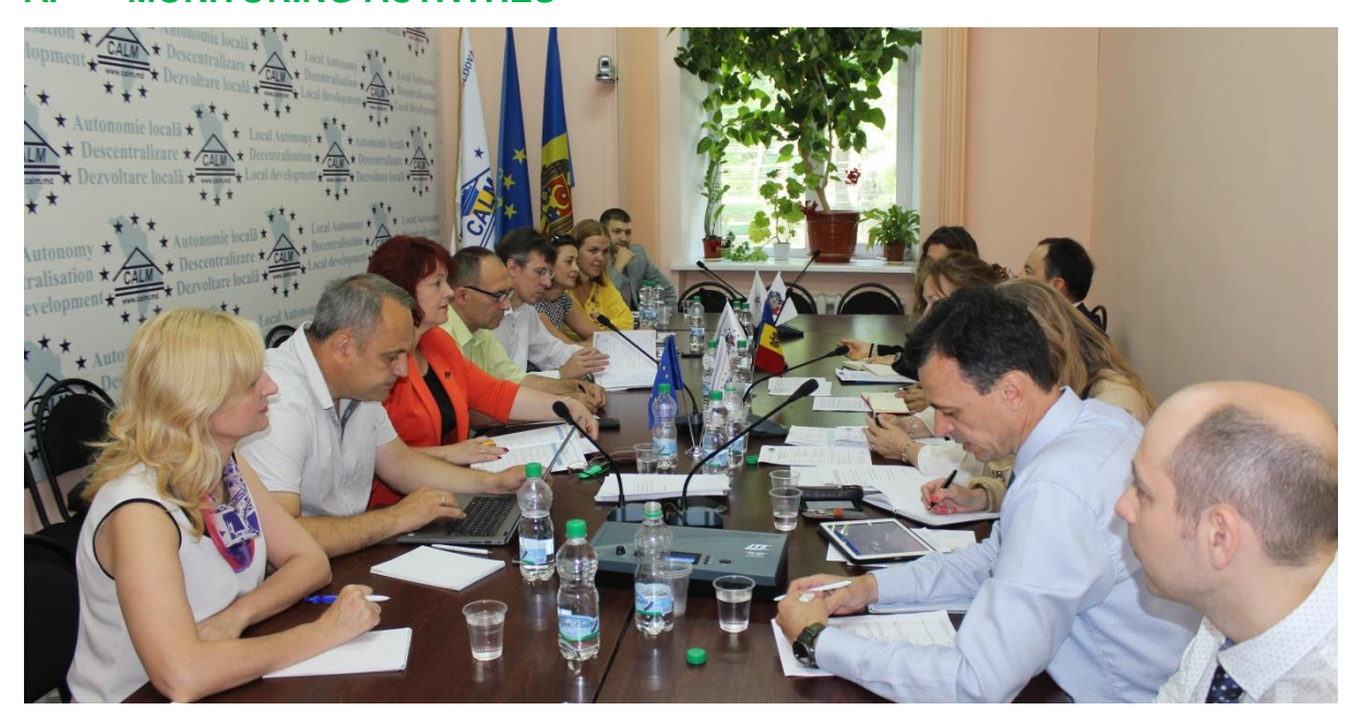
A Congress delegation carried out a monitoring mission from 13 to 15 June 2018 to the Republic of Moldova.

The core mission of the Congress of Local and Regional Authorities is the effective monitoring of the situation of local and regional democracy in member States by assessing the application of the European Charter of Local Self-Government, adopted in 1985 and ratified by the 47 member States of the Council of Europe.