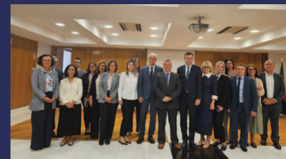
Onsite visit and bilateral exchanges in Lisbon, Portugal