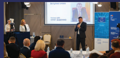
Strategic session on the CEC Communication Strategy for post-war elections