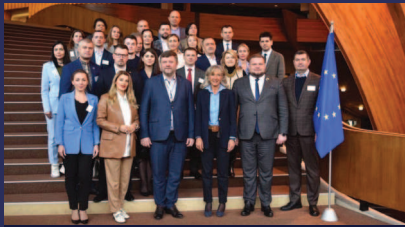
High-Level Dialogue – I