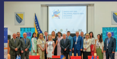
Onsite visit and trilateral exchanges in Sarajevo, Bosnia and Herzegovina