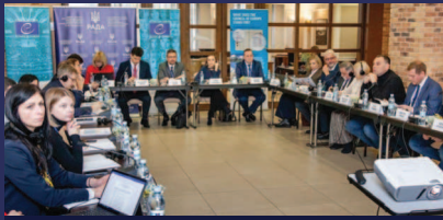
Expert discussion on electoral rights in context of transitional justice