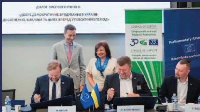
High-Level Dialogue – III