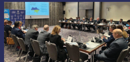
Expert discussion on criteria of possibility/impossibility to conduct elections/referenda in Ukraine in the post-war period