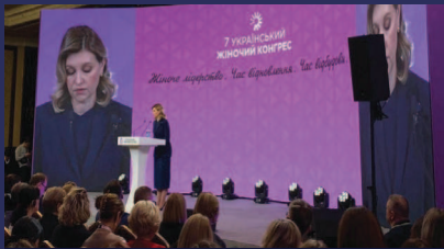
VII Ukrainian Women's Congress