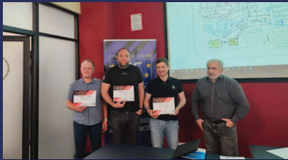
Training on ITIL for the CEC Secretariat IT staff

7 training courses on innovative cybersecurity systems and solutions for the CEC Secretariat IT staff