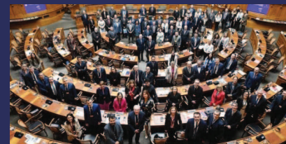
International conference “Elections in Times of Crisis”, Bern, Switzerland