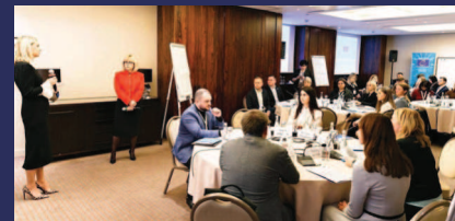
Strategic session on gender-balanced participation and representation of women and men in public, political and electoral processes in Ukraine