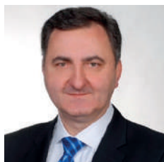
Lado Chanturia Judge of the European Court of Human Rights