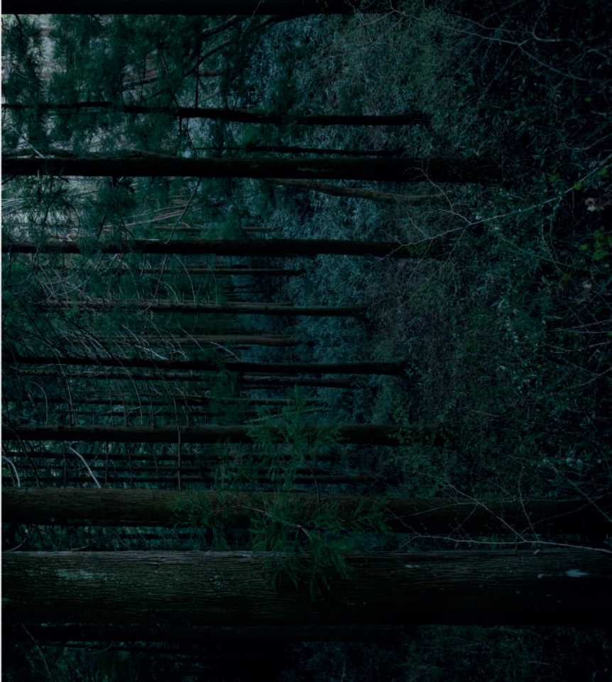
La forêt de la Nuit. Fukushima - Japon

Du ciel tombaient des flocons de l'explosion, je me suis demandé pendant nous allions mourir. Katsutaka Ito-gawa, ancien maire de Futaba