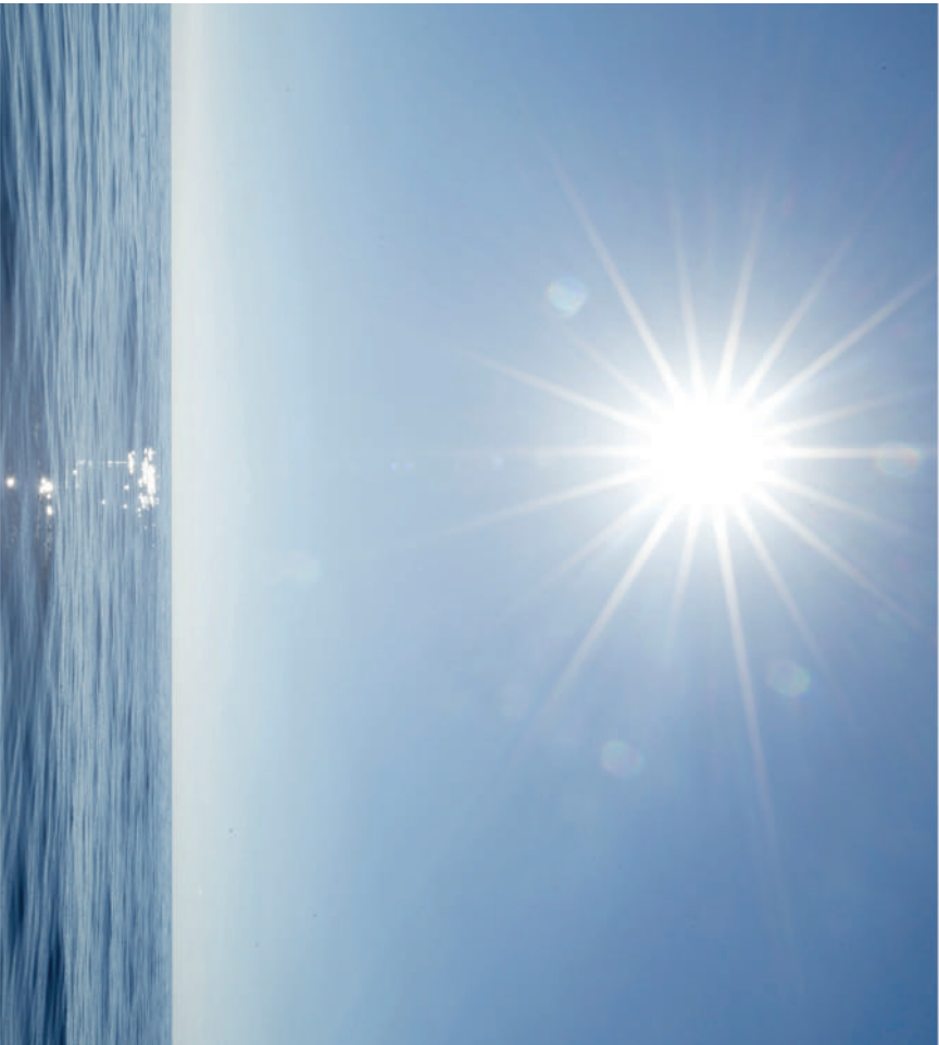
Les larmes de sirènes Océan Pacifique Nord

Chaque année, 8 millions de tonnes de plastique sont déversées en mer. Des déchets ménagers, des filets de pêche, des « larmes de sirènes » (des microbilles servant de matière première dans l'industrie), et surtout des plastiques à usage unique. Des emballages utilisés quelques secondes qui contamineront les océans pour des siècles. Lorsqu'une bouteille de plastique se fragmente, au fil de l'eau, de l'attaque des UV et de quelques bactéries, elle produit à elle seule 20 000 morceaux de microplastiques d'un millimètre ou de quelques dizaines de microns.