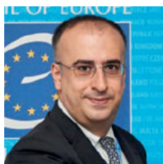
Irakli Giviashvili Ambassador, Permanent Representative of Georgia to the Council of Europe

High level International Conference on Human Rights and Environmental Protection: Human Rights for the Planet , organized on 5 October 2020 by the European Court of Human Rights together with the Ministry of Foreign Affairs of Georgia was an excellent opportunity to bring together renowned practitioners and academic experts in the field of international human rights law and international environmental law.