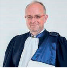
Tim Eicke Judge of the European Court of Human Rights