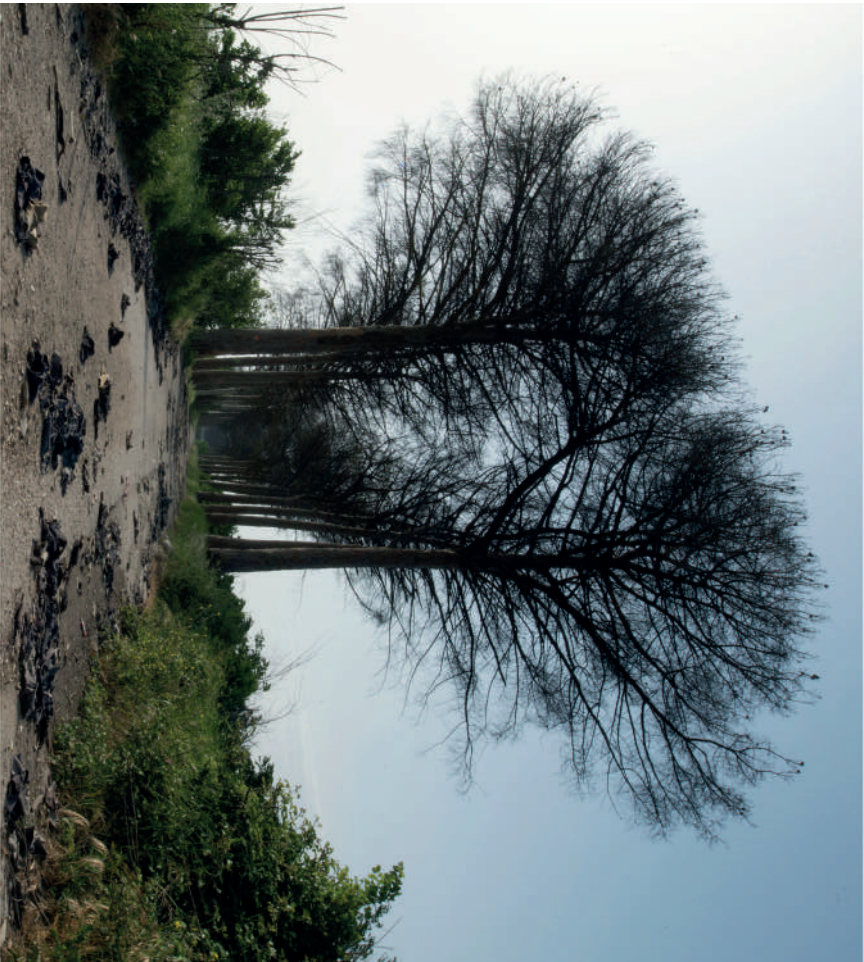
Le triangle des tumeurs. Casale di Principe - Italie

Tous les villages sont contaminés. Les habitants risquent de mourir du cancer, il leur reste peut-être vingt ans à vivre.