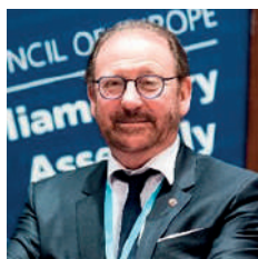
Rick Daems President of the Parliamentary Assembly of the Council of Europe

Distinguished President of the Court, Distinguished Judges of the European Court of Human Rights, Ladies and gentlemen,