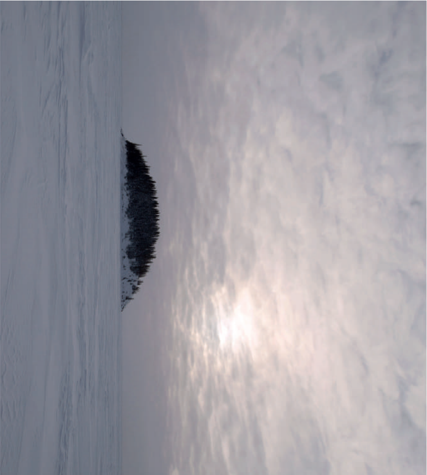
La Mère Nature. Alberta - Canada

Une prophétie disait qu'un jour les leaders seraient contrôlés par le côté obscur