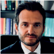
Robert Spano President of the European Court of Human Rights