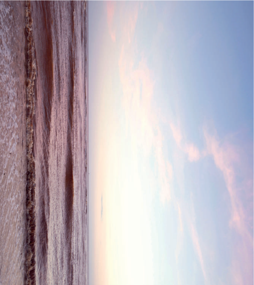
Le fleuve mort Minas Gerais - Brésil