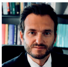
Robert Spano President of the European Court of Human Rights

Madame Secretary General, UN High Commissioner for Human Rights, President of the Parliamentary Assembly of the Council of Europe, Ambassadors, Distinguished colleagues and guests,