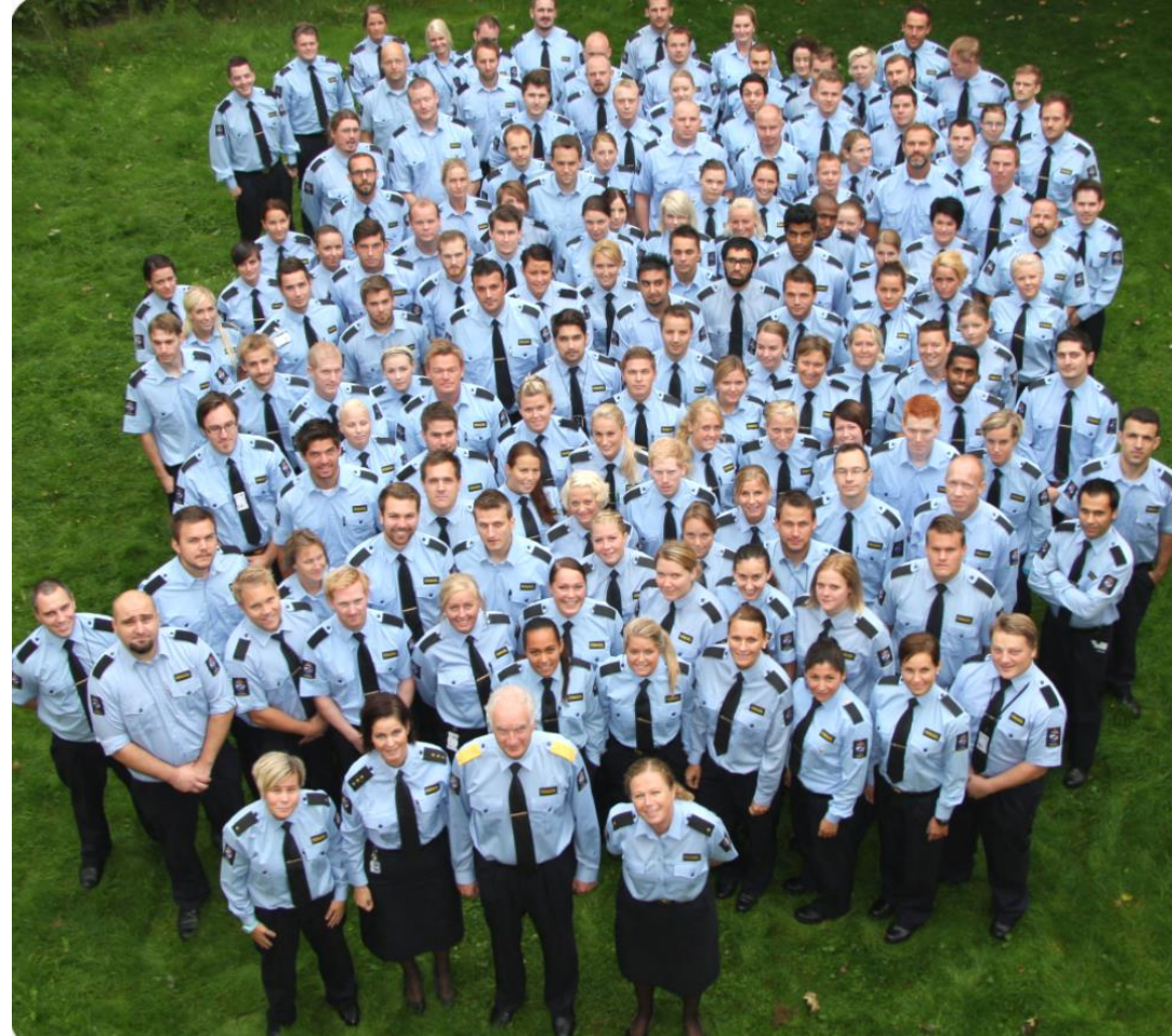
Class of 2012