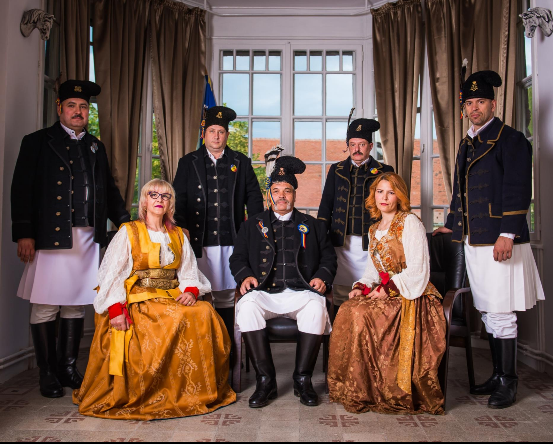
Inhabitants from Schei dressed in traditional clothes