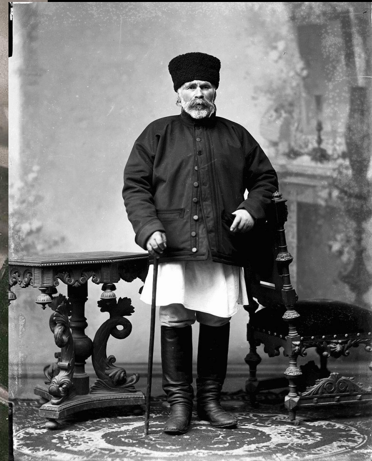
Wedding picture (1880) Wallachian from Schei (1902)