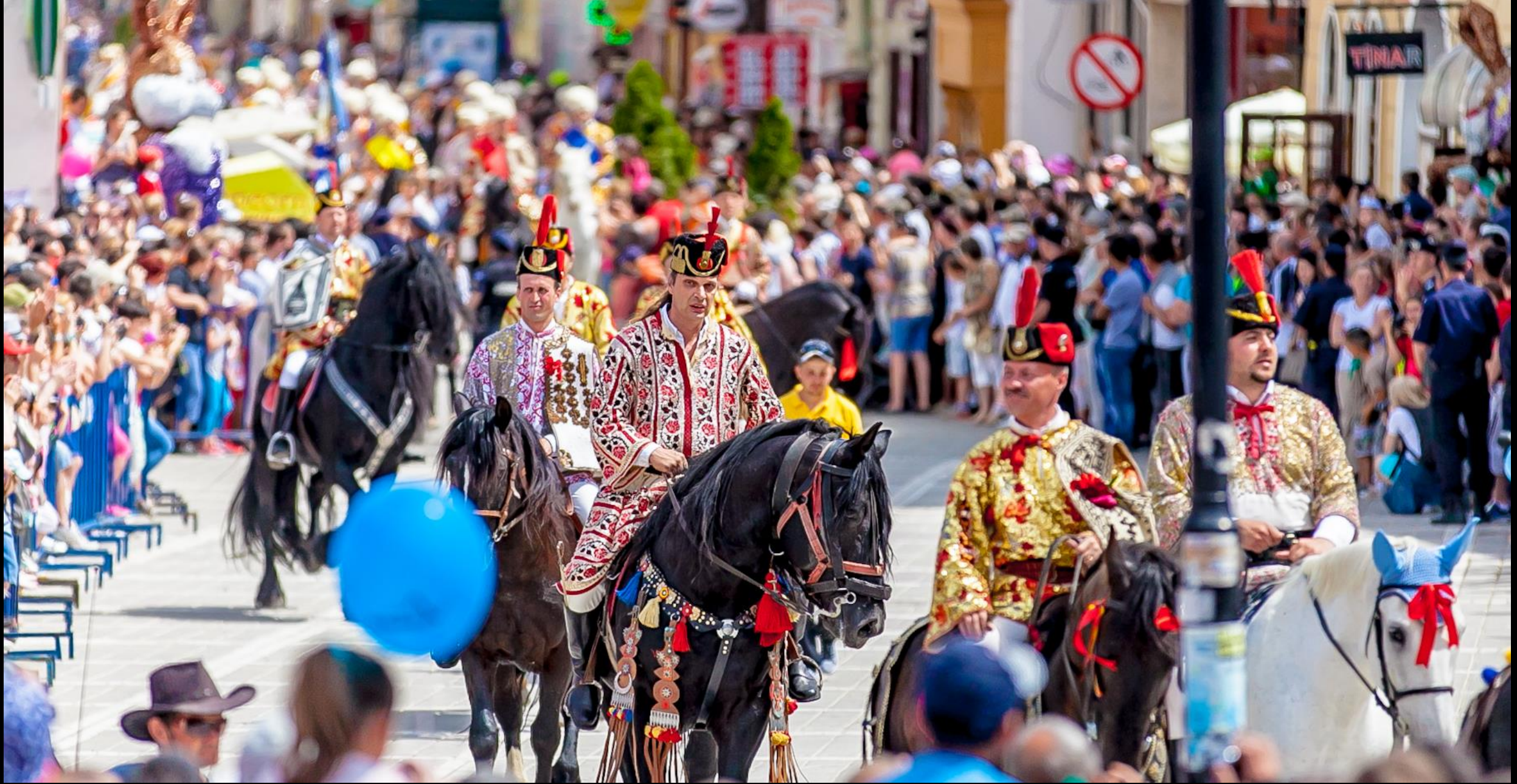
A PUBLIC OF OVER 50 000 SPECTATORS ON THE STREETS OF BRASOV