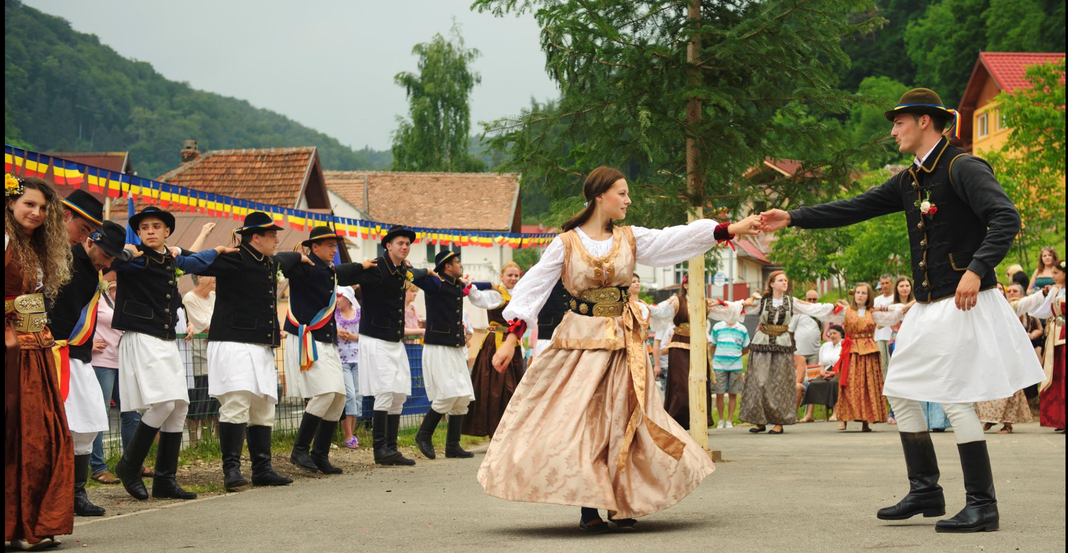
Traditional Romanian dance SARBA