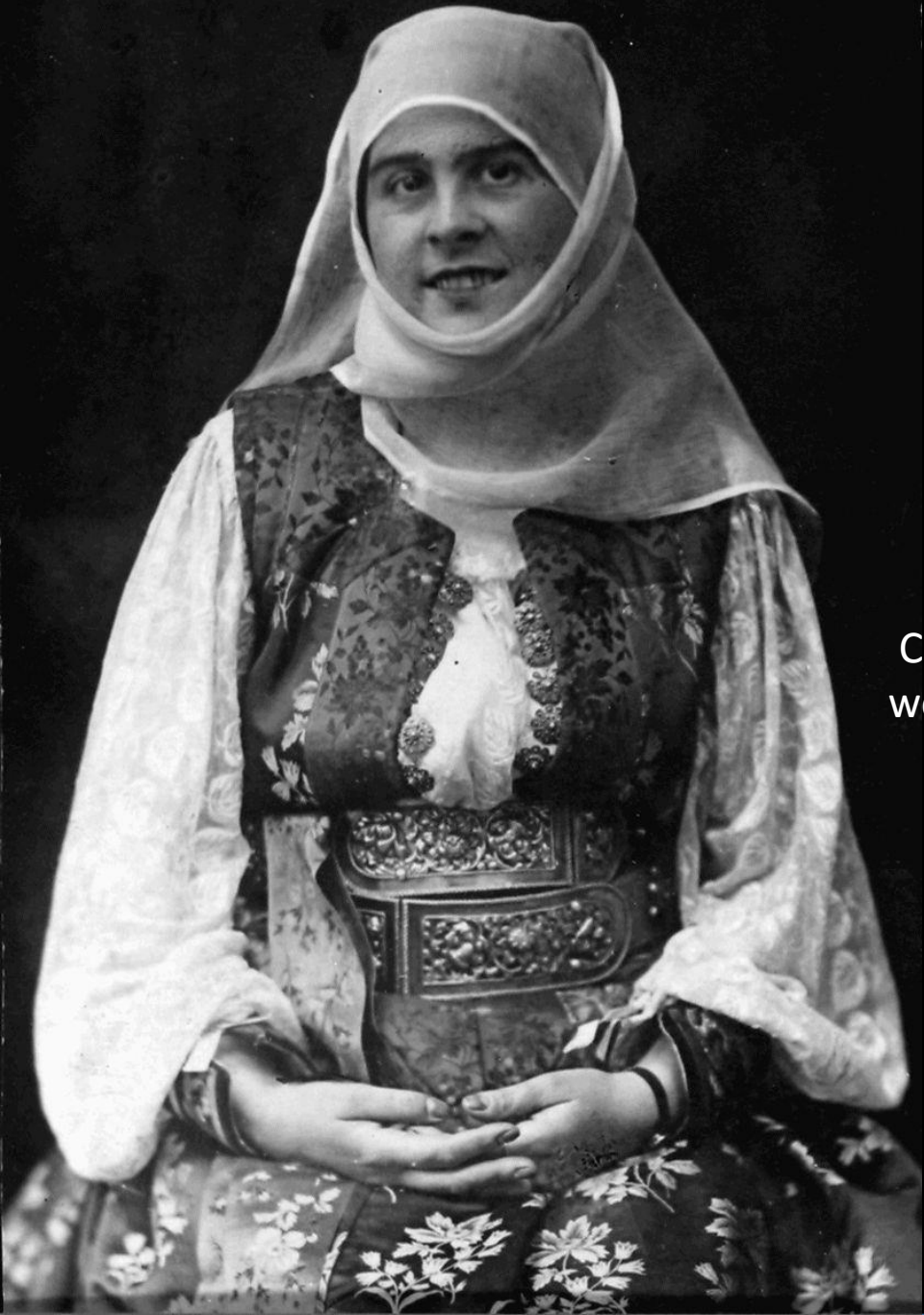
Clothes for married women from Schei