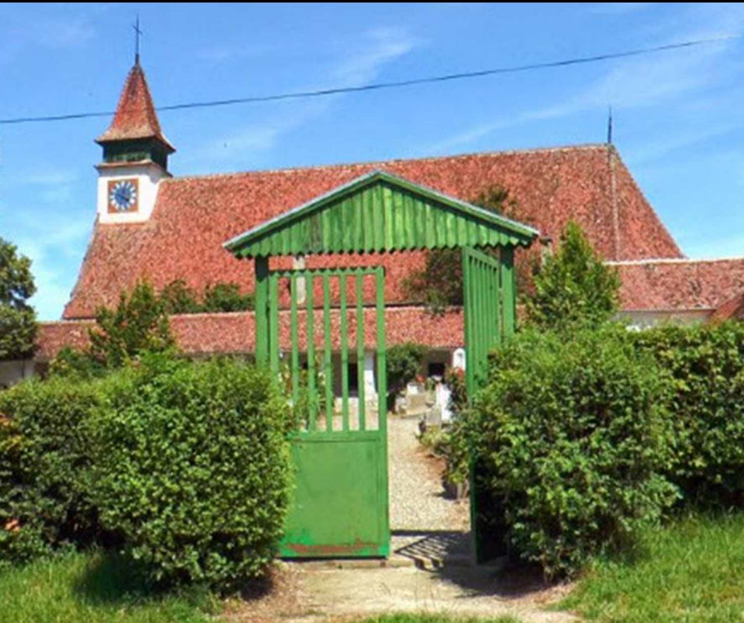
Gothic style St. Martin's Church (Lutheran Church)