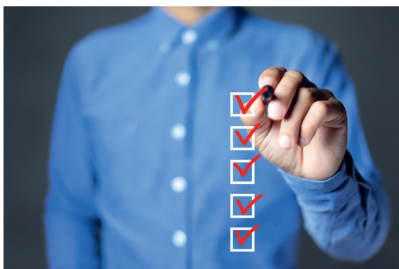
Checklists are valuable tools for States Parties self-assessment of the implementation of the Convention standards

” The checklists are intended to help States assess the compliance of their arrangements with the Saint-Denis Convention