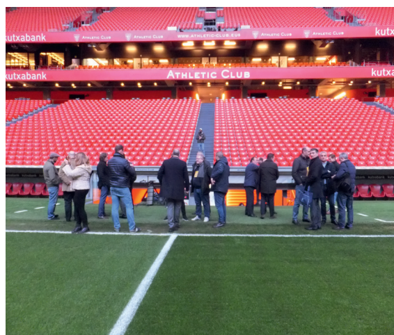
The checklists also serve as a basis for monitoring visits by the Saint-Denis Committee

” The checklists can also be used as a basis for national self-assessment reports