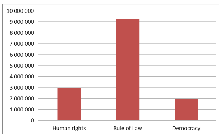
Figure 2: Estimated budget per theme of the Neighbourhood Partnership with Tunisia 2018-2021

The present Neighbourhood Partnership structure follows the structure of the Programme and Budget of the Council of Europe and is in line with its two biennial cycles in order to increase coherence, complementarity and co-ordination.