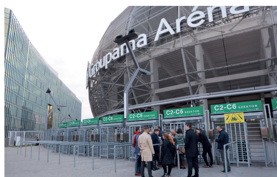
Monitoring visits of the Saint-Denis Committee and technical assistance missions also aim at identifying and replicating national good practices

■ The good practices set out are not only addressed to States. The aim of the recommendation is also to deliver a number of good practices in a form that is accessible to people and entities with a common desire to turn sports events into safe, secure and enjoyable experiences. This includes national and local/municipal public authorities and bodies, police and emergency services, stadium owners, event organisers, stadium safety managers and field teams involved in safety management arrangements.