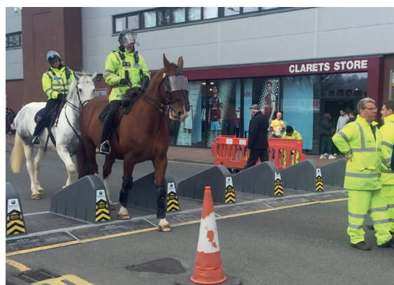
The use of horses as part of a policing strategy can be an effective tool in specific circumstances

■ The recommendation focuses on the recognised need to develop and implement an integrated multi-agency approach to safety, security and service 2 at sports events. To this end, the recommendation specifies the importance of establishing comprehensive national, regional and local co-ordination structures, as well as effective partnerships at international level.