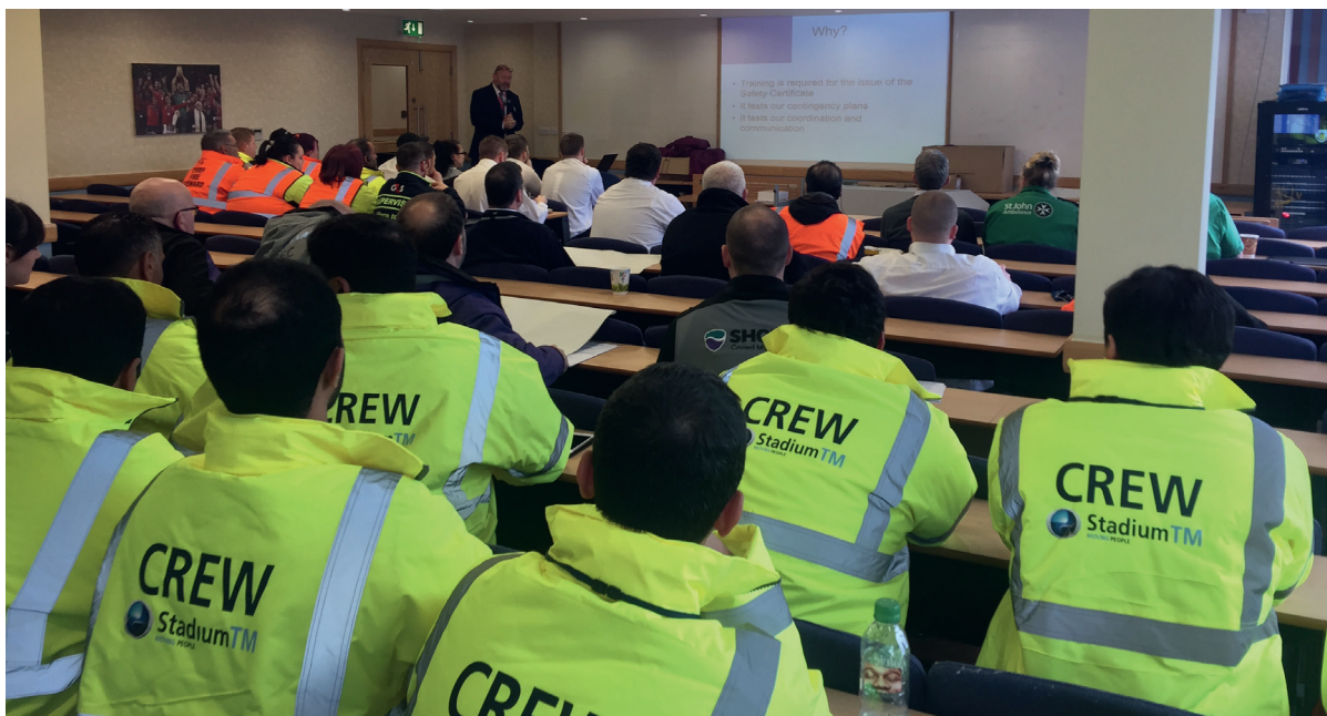
Existing European standards on stewards training and equipment are a reference for national improvements in the field of safety

” The 2021 Recommendation will be regularly updated and supplemented by specific recommendations