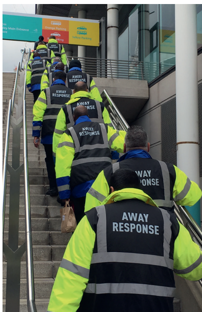
National good practices are shared and adapted to other countries' specific context, like stewarding activities