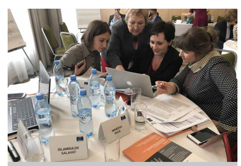
Training on procurement, Ufa, 27-28 February 2019