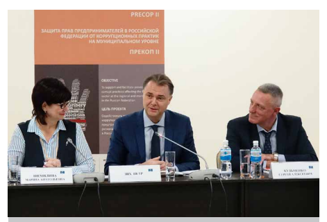
Workshops on procurement and reporting corruption, Vladivostok, 8-9 October 2018

The project organised <u>54 activities</u> (i.e. workshops, trainings, Steering Committee meetings, working group sessions) involving <u>2300 participants</u> from <u>62 regions</u> of the Russian Federation, including <u>54 Regional Business Ombudspersons</u>, as well as high-level representatives of executive and legislative bodies of the project pilot regions.