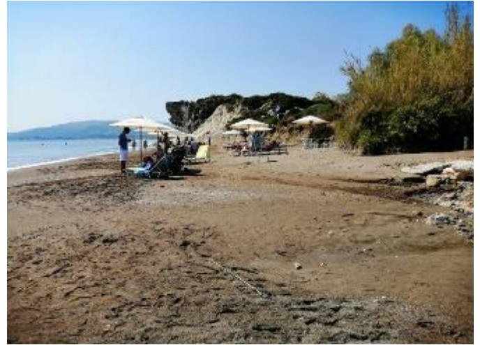
Photo 8b: The minimum distances from the back of the beach were not observed (Kalamaki, September 2020).