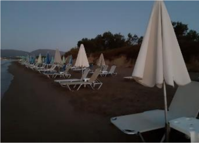
Photo 8a: Beach furniture removal was implemented either incorrectly or not at all (East Laganas, August 2020).