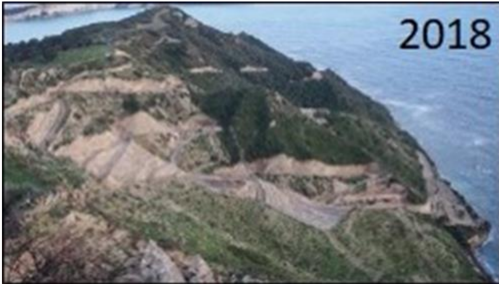
Photo 4a: The illegal road (providing access to the sea between Daphni and Gerakas beaches) constructed in 2015 and 2018 was never demolished or restored.