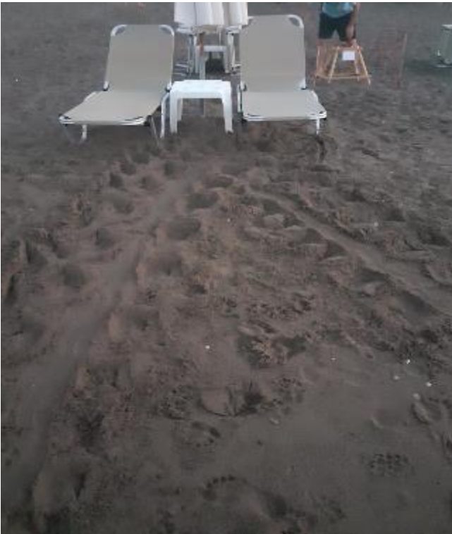
Photo 9a: Abandoned sea turtle nesting attempt as the nesting zone was blocked by sunbeds (Kalamaki, July 2020).