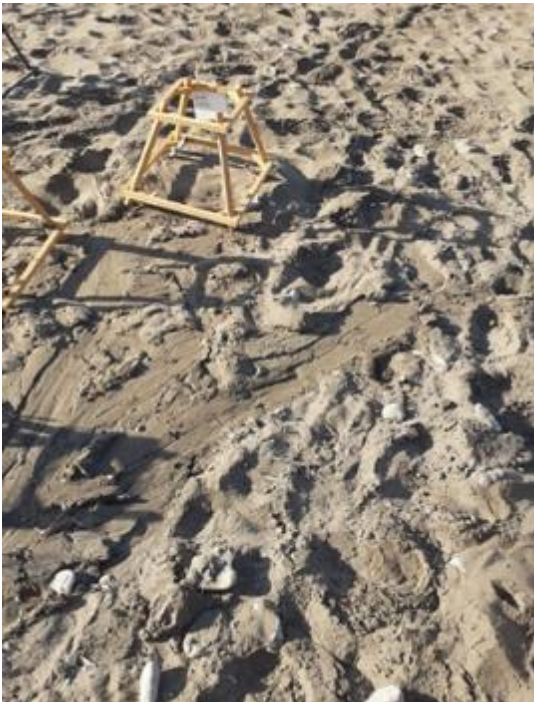
Photo 3b: Shower run off from the illegal businesses affecting incubating nests (Daphni, August 2020).