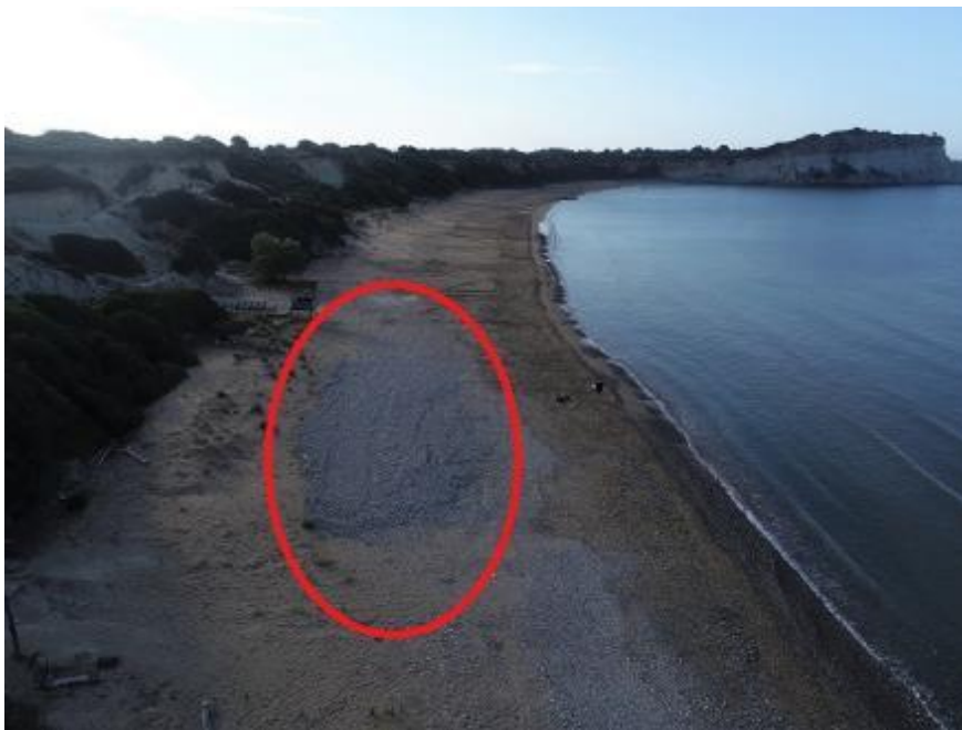
Photo 2: The north-west part of Gerakas beach is not suitable for nesting due to natural deposition of pebbles.