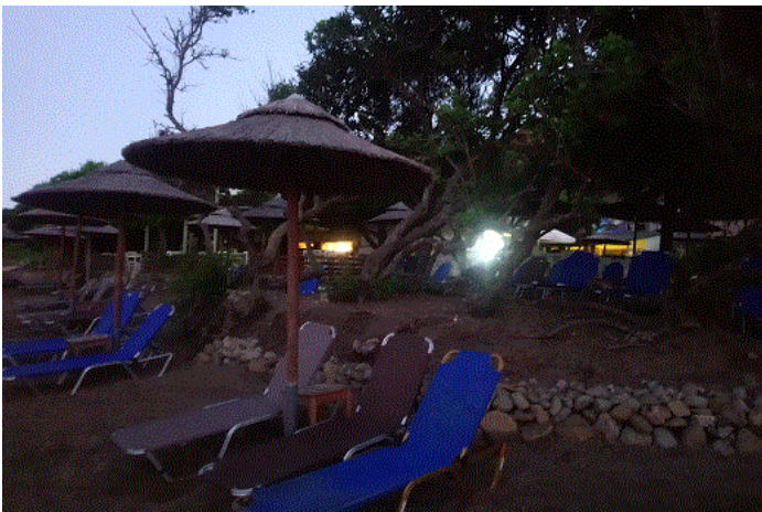
Photo 6: Light pollution at Daphni beach originating from illegal businesses (August 2020).