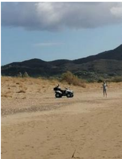
Photo 12: Quad bike on the nesting beach (East Laganas, September 2020).