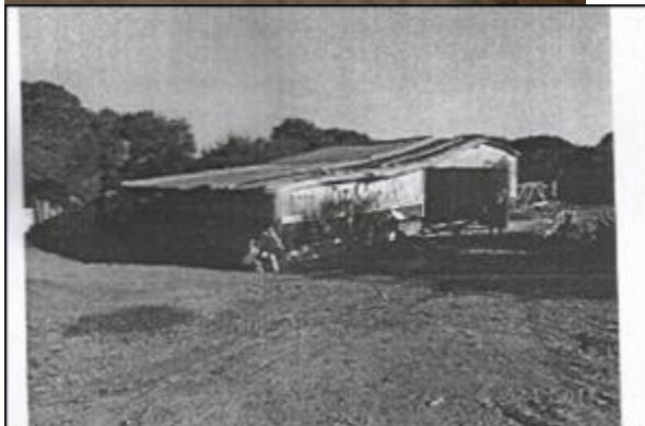
Photos 4b, c: Illegal buildings behind Gerakas nesting beach that are not demolished so far.