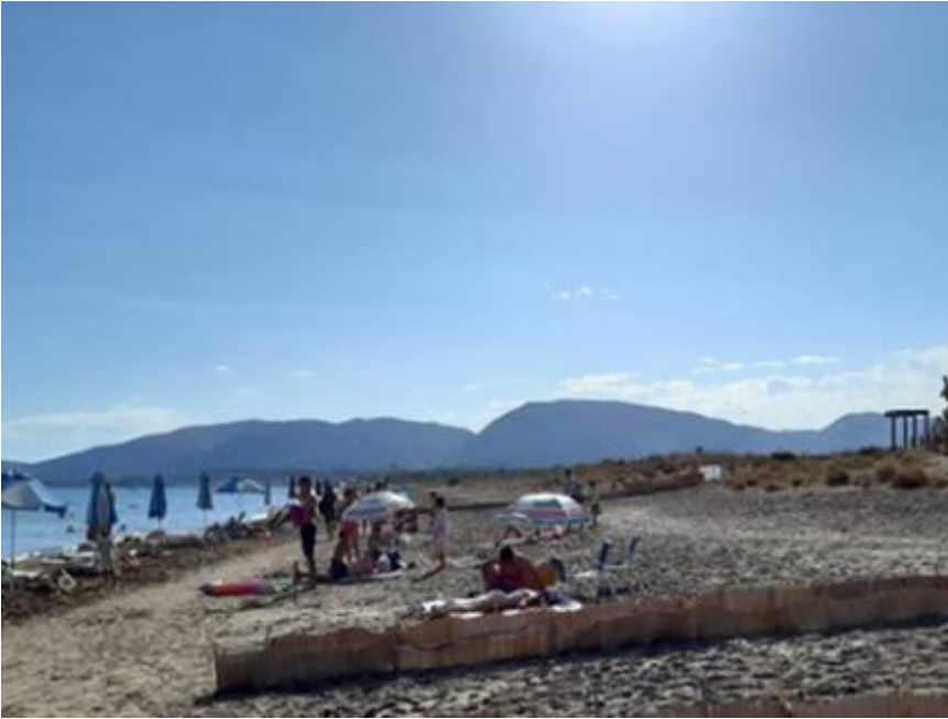
Photo 9b: Private beach furniture not complying with the minimum distances from the back of the beach (East Laganas, August 2020).