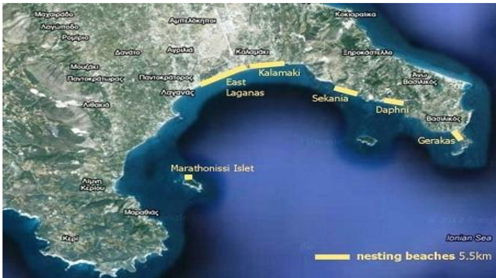
Illustration 1: Map of the six nesting beaches in Laganas Bay.