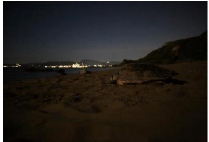
Photo 7: Light pollution originating from West Laganas was visible from almost all nesting beaches in Laganas Bay (photo taken from Sekania, July 2020).