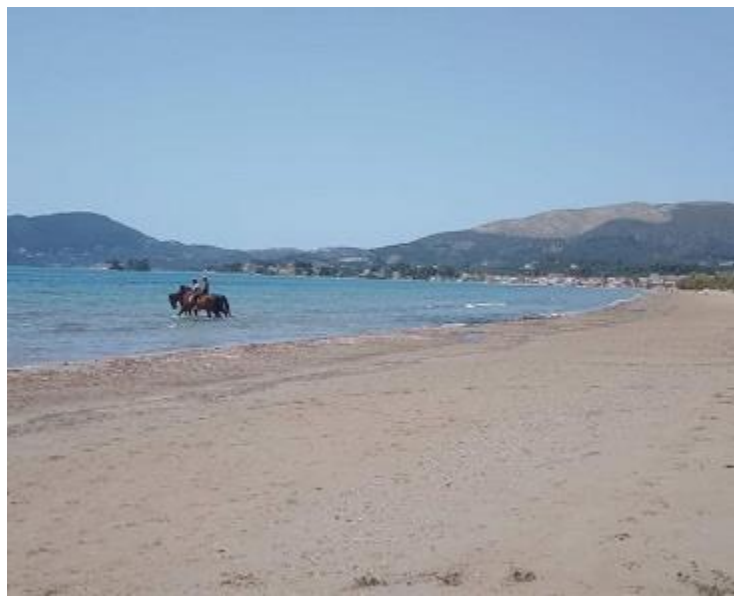
Photo 13: Horse riding on the nesting beaches was observed on a daily basis (East Laganas, September 2020).