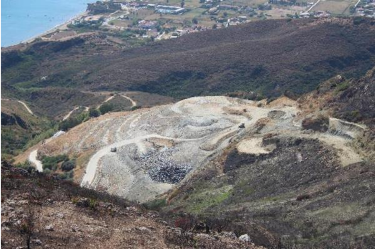
Photo 5: The illegal landfill located within the boundaries of the NMPZ.