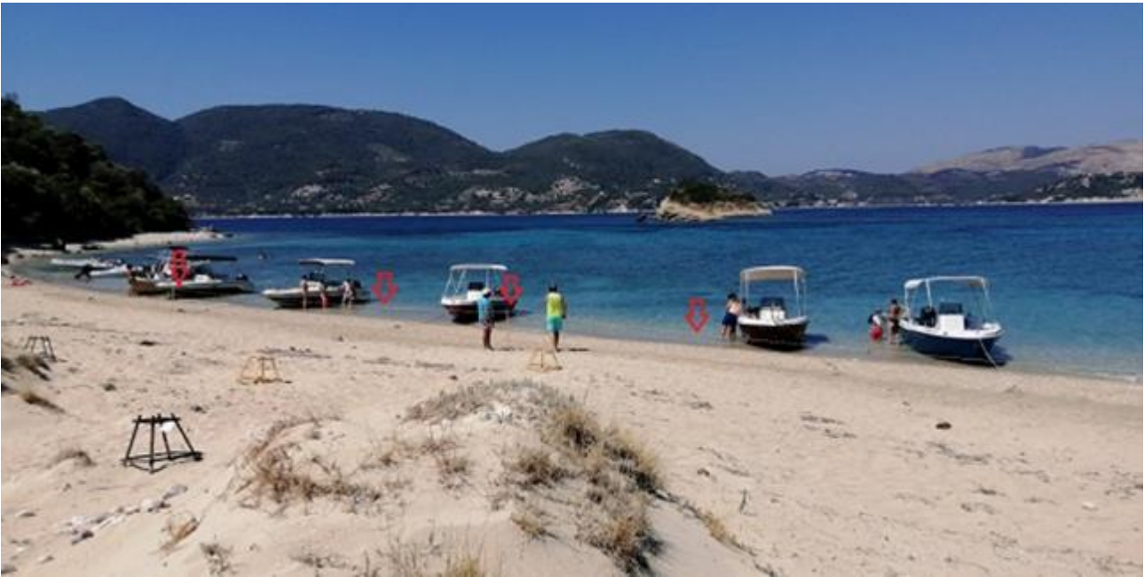
Photo 11: Use of ropes by the NMPZ to block access of visitors towards the nesting zone at the back of the beach (Marathonissi, August 2020).