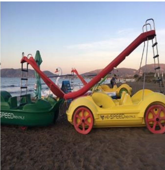
Photo 10: Pedalos blocking beach access to female sea turtles attempting nesting (East Laganas, August 2020).