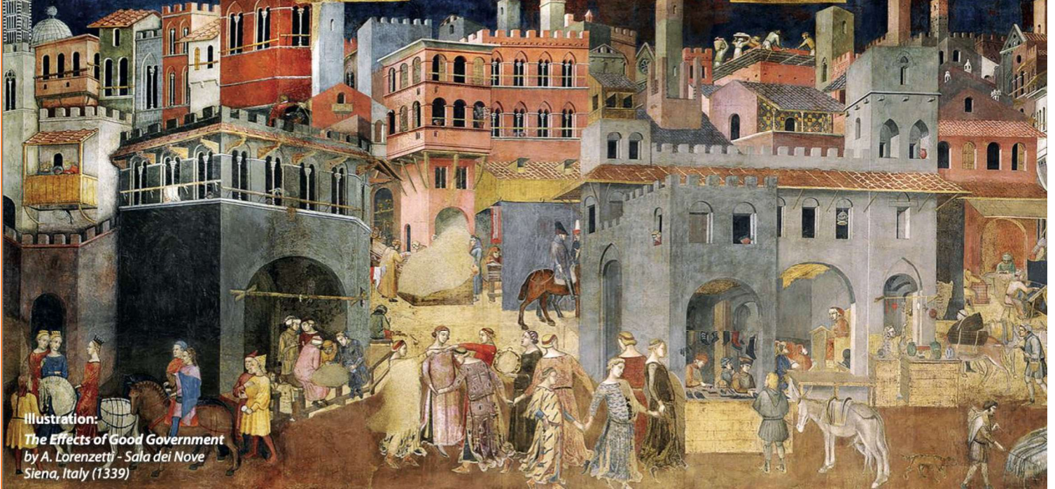
Illustration: The Effects of Good Government by A. Lorenzetti - Sala dei Nove Siena, Italy (1339)