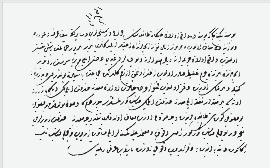
III. 3 Decree of Sultan Selim II in 1574 (from Marushiakova / Popov 2001, p. 33) (Detail)