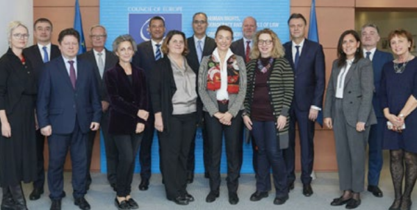
Heads of Council of Europe Offices and Programme Offices meet with Secretary General Marija Pejčinović Burić at the occasion of their bi-annual meeting in November 2019 in Strasbourg.

■ The Council of Europe is a leading Organisation providing support for human rights, the rule of law and democracy. The Office of the Directorate General of Programmes (ODGP) designs and co-ordinates these co-operation activities in member states and the neighbourhood. The support is undertaken to help countries reach European standards in these fields, making a significant contribution towards the achievement of the United Nations Sustainable Development Goals.