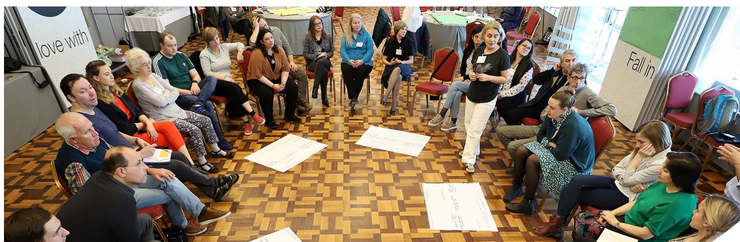
Global Education Network Meeting - January 2020