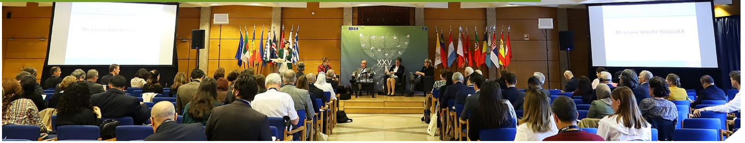
XXV Lisbon Forum - 2019