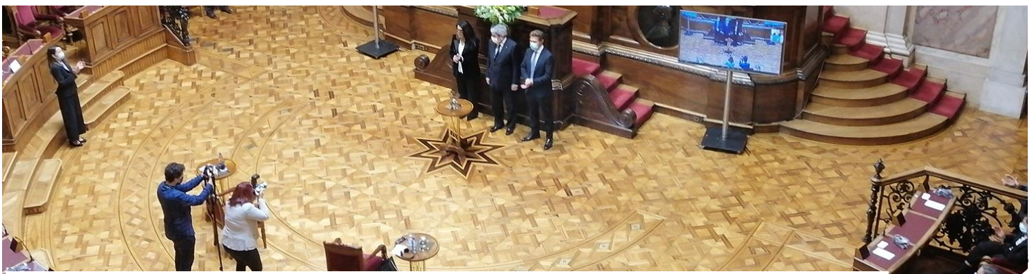
North-South Prize of the Council of Europe Award Ceremony 2019 - 2020