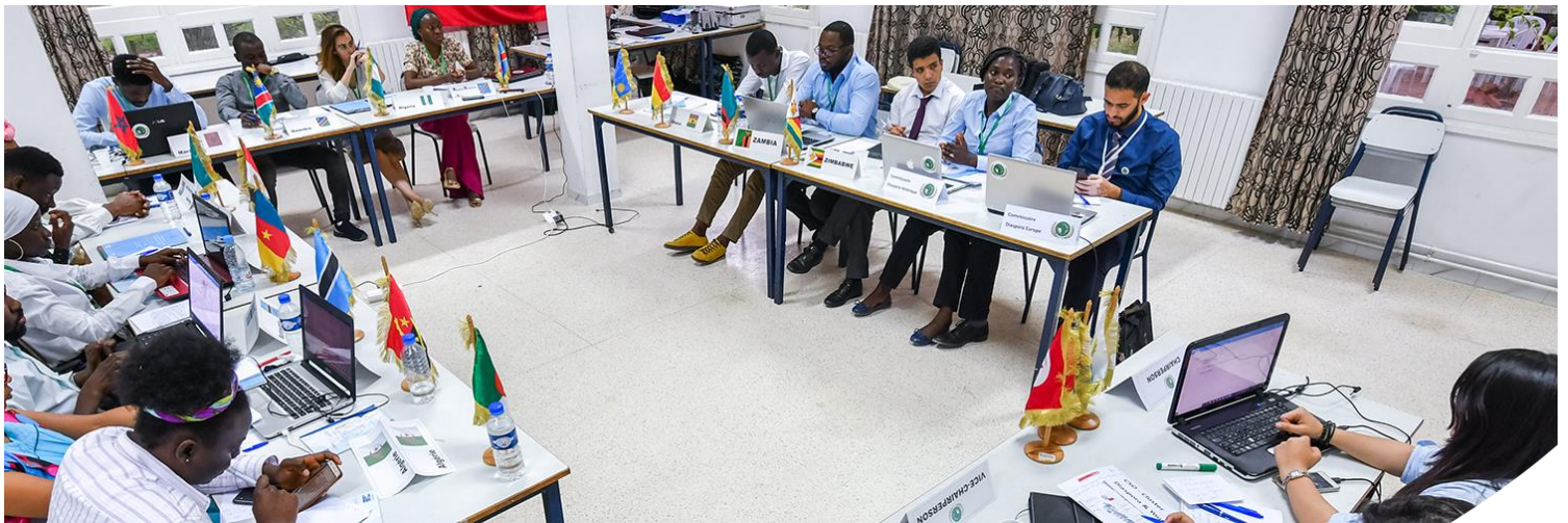
MEDUNI - 2019

On the 10th anniversary from the establishment of the Network, the publication aims at presenting its work, achievements, and contribution for the strengthening of the international youth cooperation and for the development of the youth work and youth policies.