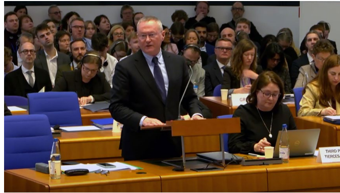
Commissioner O'Flaherty during the hearings before the European Court of Human Rights

I also went to Brussels to strengthen the dialogue with EU and civil society representatives . I held exchanges with the LIBE and DROI Committees of the European Parliament, where I emphasised the importance of cooperation and vigilance in safeguarding human rights. I also met with EU Commissioner Hadja Lahbib to discuss cooperation in advancing equality and human rights, including for Roma and Travellers, and with civil society representatives to reinforce the synergies for collective action.