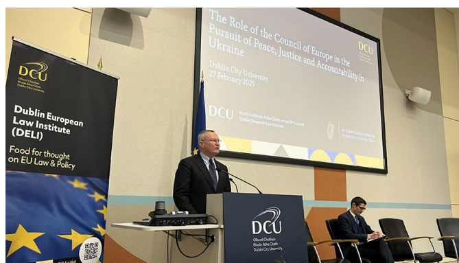
Commissioner O'Flaherty speaking at the Conference "The Role of the Council of Europe in the Pursuit of Peace, Justice and Accountability in Ukraine"

Finally, I took part in two topical human rights conferences . In the Annual Lecture organised by the Northern Ireland Human Rights Commission I focused on the need to uphold the rule of law , warning against complacency , calling for decisive leadership and greater investment in oversight institutions. At the Dublin conference on "The Role of the Council of Europe in the Pursuit of Peace, Justice and Accountability in Ukraine" I set out ten points for a human rights roadmap towards a just, fair, lasting, and effective peace , stressing that Ukraine owes us nothing. It is we who owe Ukraine an undying debt of gratitude for being the ones willing to stand up to Russia.