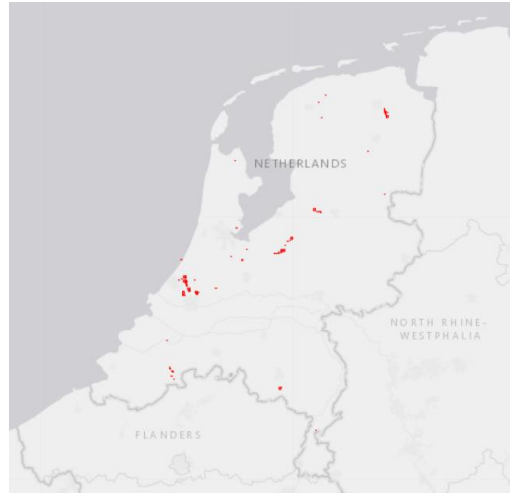
Rosse Stekelstaart - Oxyura jamaicensis - Waarneming.nl