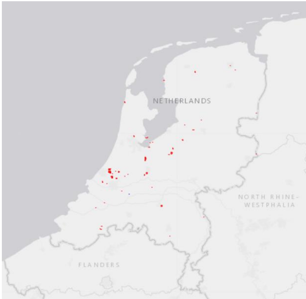
Rosse Stekelstaart - Oxyura jamaicensis - Waarneming.nl