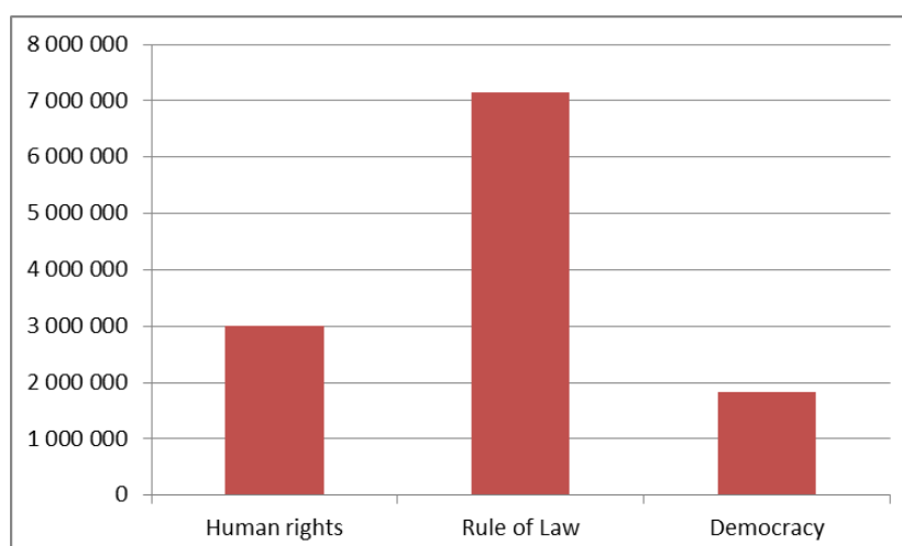
Figure 2: Estimated budget per theme of the Neighbourhood Partnership with Morocco 2018-2021

The present Neighbourhood Partnership structure from 2018 to 2021 follows the structure of the Programme and Budget of the Council of Europe and is aligned with its two biennial cycles in order to increase coherence, complementarity and co-ordination.