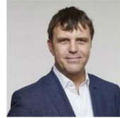
Nigel Topping, UK High-Level Climate Action Champion