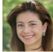
HRH Princess Dana Firas, Petra National Trust President and UNESCO Goodwill Ambassador for Cultural Heritage