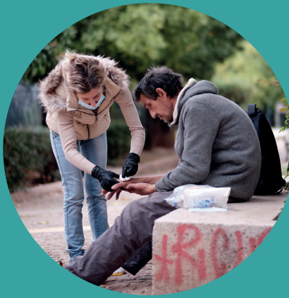
Street Work Actions in Greece, by Okana 2020

The COVID-19 crisis has had a profound impact on the delivery of health services, particularly harm reduction services. DCRs worldwide have been challenged during the pandemic, as well as people who drug users. DCRs had to adapt their facilities so that physical contact could be avoided through physical distancing. However, during the first wave of the pandemic, many services had to restrict access to their premises or close their doors by order of the health authorities.