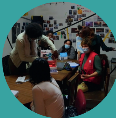
Staff training Lisbon

Creating a network of DCRs would increase collaboration between European cities to establish key partnerships and help create new DCRs in Europe. Participants discussed the creation of a European network of DCRs that could include field actors, local politicians, practitioners, field organizations, as well as drug user representatives in order to continue discussions on good practices and exchange views. Stakeholders expressed their desire to join forces and bring together existing associations in order to have the greatest possible impact. The opportunity to form a platform for political advocacy was also discussed. The statutes and objectives of this new network remain to be defined during a future general assembly, with the support of the Pompidou Group and the City of Strasbourg.