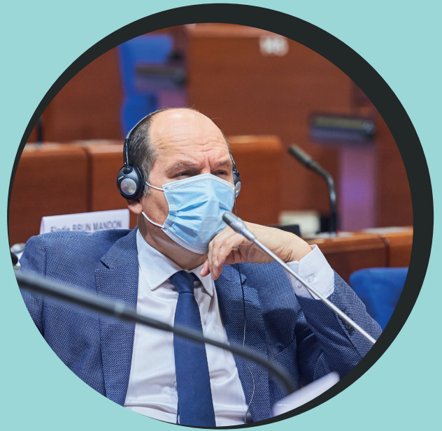
PHILIPPE CLOSE Mayor of Brussels

"This is not a moral judgment. The most important thing to remember here is that we are health actors when we work on this, we are social actors when we promote and develop this type of centre, that's our role, we don't go beyond that."