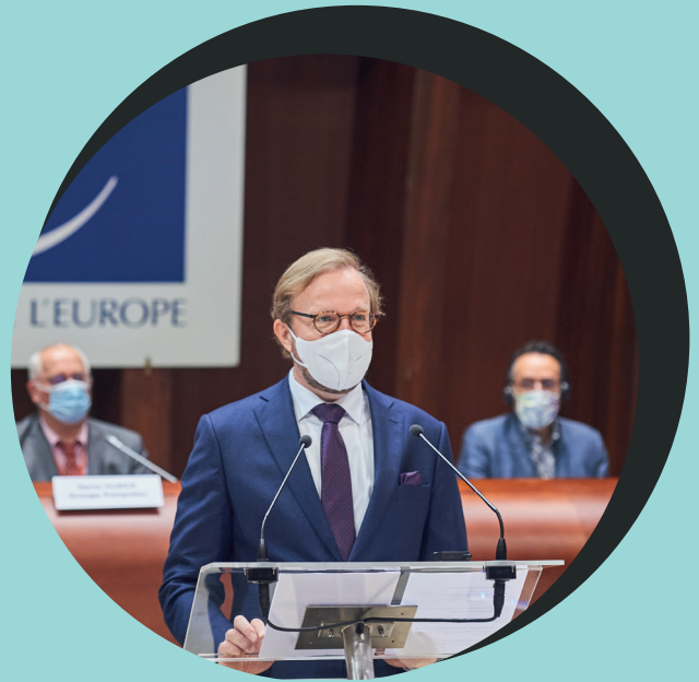
BJORN BERGE Deputy Secretary General of the Council of Europe

"Drug consumption rooms have proven to be effective tools for improving public health and safety at the local level. They are an effective way to reach and stay connected with highly marginalized populations, supporting their access to addiction care and treatment."