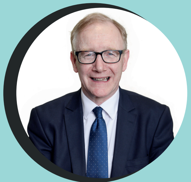
FRANK FEIGHAN Minister for Public Health and National Drug Strategy, Ireland Irelande

"These facilities also respect the human rights of people who inject drugs by providing a safe, hygienic and private place to do so."