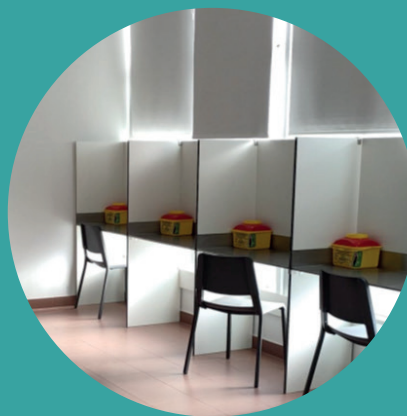
DCR fixed in Lisbon since May 2021

In many European countries, the community and harm reduction workers are fighting and advocating for the opening of DCRs to improve services for people who use drugs. In the last few years, some countries have opened such structures after sometimes decade-long struggles, while in other countries the discussion is still going on.