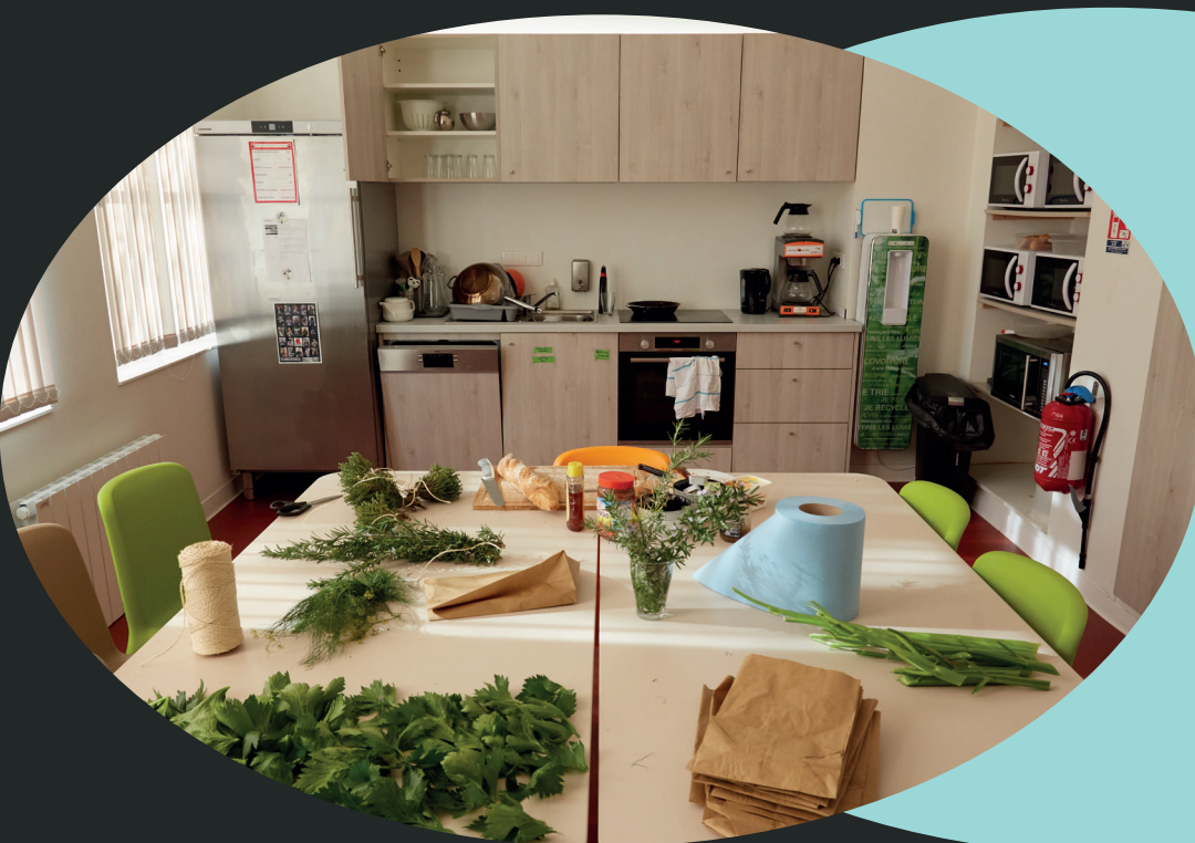
Photography Marine Saiah Lodging Argos Strasbourg, device of the association Ithaque.

This temporary stay, lasting two months and renewable, is a springboard for care for the people for whom it is intended, a link between the street and an "aftercare" situated in the fabric of the common law.