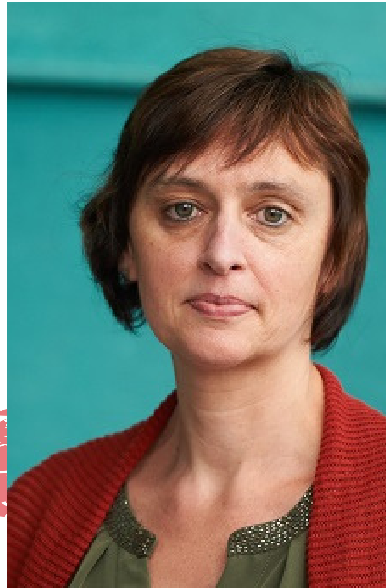
Vlce Chair C.de Craim

STEPPING UP PROTECTION OF CHILDREN AGAINST SEXUAL EXPLOITATION AND ABUSE IN TIMES OF THE COVID-19