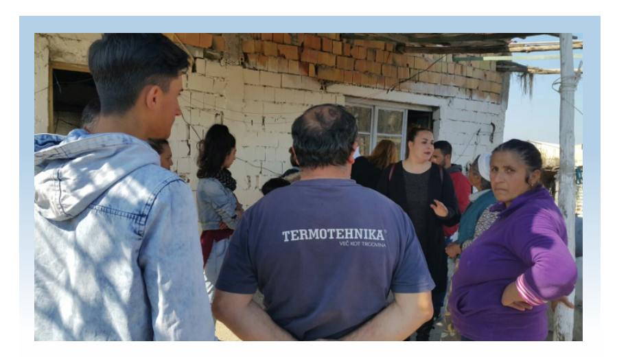
Figure 2. Meeting with a Community Action Group and an institutional Working Group on prioritisation