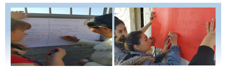
Figure 3. The "Ranking Matrix" Exercise