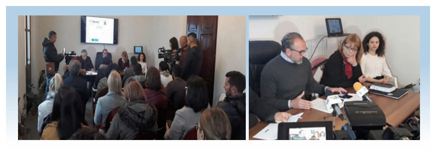
Figure 6: Orientation towards vocational internships