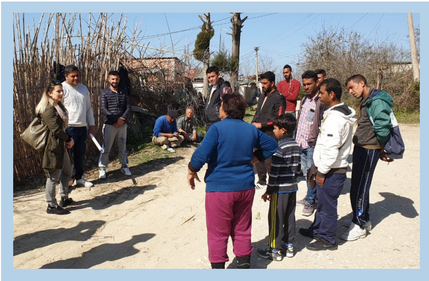
Figure 3. Focus group on priorities identified earlier by the facilitators - Mbrostar

During the numerous visits in the targeted areas, meetings were held with the community both indoors, and in Roma and Egyptian settlements, outdoors.