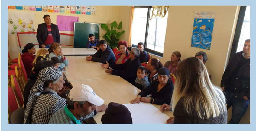
Figure 4. "Problem Tree" Levan

In order to have a more focused and deeper discussion, as well as understand the problems and needs, a focus group approach was also applied, as well as "Problem tree" and "Problem matrix" techniques.