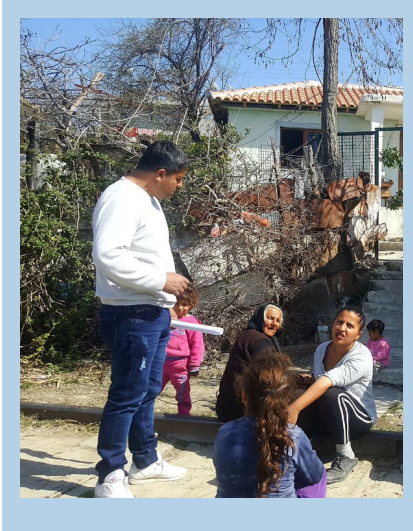
Figure 2. (Unstructured) interview with beneficiaries of the housing programme (reconstruction of homes), Mbrostar

During the numerous visits in the targeted areas, meetings were held with the community both indoors, and in Roma and Egyptian settlements, outdoors.