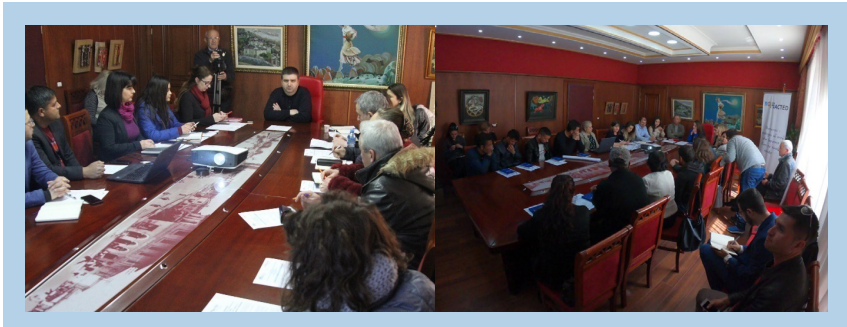
Figure 5. Pictures from meetings with the Institutional Working Group, Municipality of Fier

Priority data was also collected by the municipality, especially with regard to its capacity for the implementation of the plan for integrating Roma and Egyptian minorities (Annex 9.2).