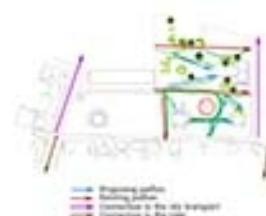
Visualizations of the underground galleries and open air stage