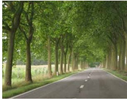
Ills. 35 and 36: In the Netherlands roads lined with two rows of trees on either side are common; by contrast this road in Belgium has a single row of plane trees on either side