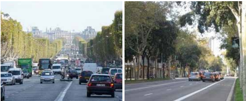
III. 6: Just before Haussmann, from 1830 onwards, prefect Rambuteau created the new Champs-Élysées avenue in Paris, lined with “English” style pavements planted with trees. III. 7: Avinguda Diagonal in Barcelona, another avenue structured by rows of trees

Within towns and cities the appearance of tree-lined streets was driven by other changes. From the early 19th century, following the earlier example of St Petersburg, cities in Scandinavia – Helsinki in 1817 and Vänersborg in Sweden in 1834, for example – began to create wide thoroughfares which were planted with trees, the aim in this case being to prevent and limit the destruction caused by fires. In Paris, prefect Haussmann embarked on a programme of grand avenues, which came to be known as boulevards, on a scale more ambitious than anywhere in Europe except Vienna. In 1856 this programme was underpinned by an edict specifying the number of rows of trees to be planted according to the width of the roadway.