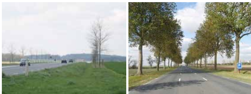
Ills. 21 and 22: Even when the local authority decides to bear the additional costs involved in land acquisition, excessive planting distances make it impossible to recreate the “cathedral” effect produced when the proximity of the road and the trees creates a distinctive and integrated space

This planting shortfall is critical given the natural ageing process affecting the remaining trees. The crisis is all the more severe because tree ageing and death are accelerated when the trees located alongside roads or streets are mistreated – and such mistreatment is all too evident.