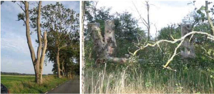
Ills. 82 and 83: In Sweden, where tree-lined roads are protected as biotopes, the trees are retained in situ , taking care to ensure their stability, or else they are cut and planted in the ground close to younger trees or on nearby surplus land, as here

The most urgent priority is to stop tree felling and to retain existing trees for their own sake, without reference to timber production policies: our current timber supply needs are already largely covered by existing forests. Moreover, the trees' function as a unique biotope makes it important to retain trees of all ages, and ancient trees in particular. These can be regenerated through appropriate treatment (pruning). They must be kept within their rows as long as the overall aesthetic impact is not affected, while ensuring that there is no risk of trees falling onto the road.