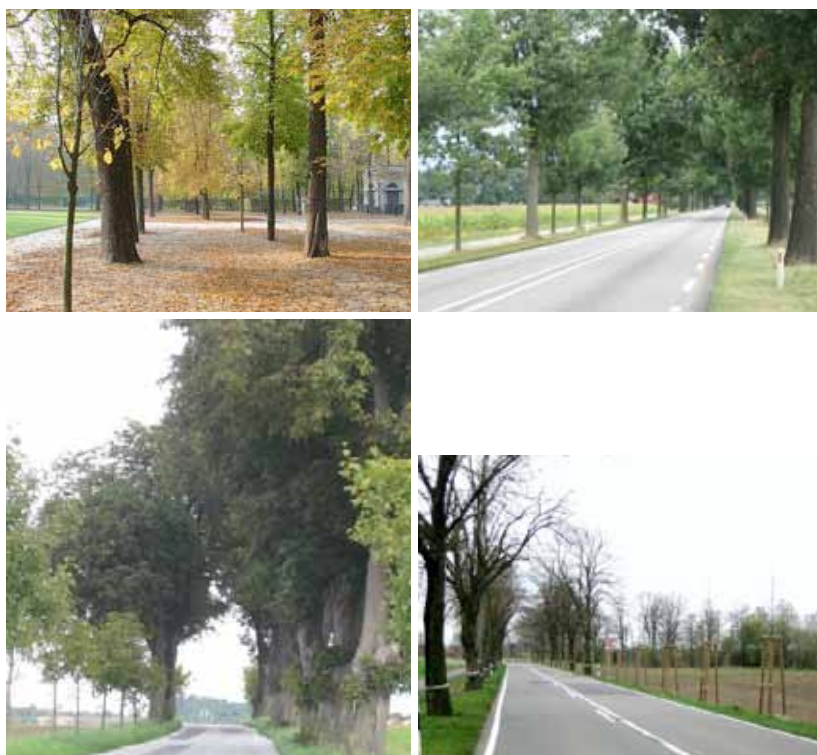
Ills. 92, 93, 94 and 95: The practice of gap-filling is systematic in towns and cities and in parks, where significant effort is expended to maintain a high-quality environment. The variation in size becomes less obvious over time and is less stark in appearance than an avenue punctuated by ever larger gaps. Three examples of gap-filling roadside plantations: North-Brabant, Scania and Brandenburg

Baudrillart, in 1823, expressed his feelings of distress: "Along the road from Paris to Saint-Denis there was a magnificent avenue of tall trees; apparently their great age prompted the decision to cut them down and replace them with a new plantation. The bareness stunned me; it's all the more distressing because it will take more than ten years not only to offer a modicum of shade to travellers but also to create the appearance of an avenue" (Baudrillart 1823).