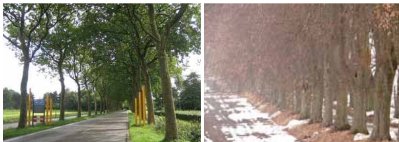
Ills. 78 and 79: Both country roads and hidden byways deserve to retain the trees that adorn them (Netherlands and Poland)

In 2005, Denmark's roads department observed that "tree-lined roads constitute ... an important element of our culture and our environment and merit special conservation as elements of our culture and landscape" – an opinion shared by the Swedish roads department.