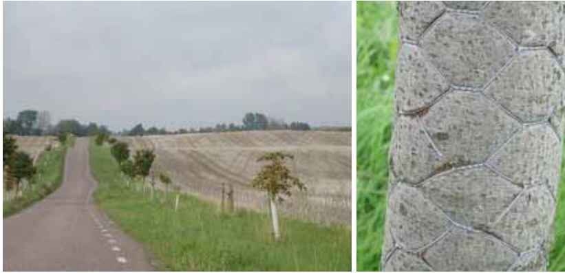
Ills. 30 and 31: Poor quality plants, poor planting conditions and lack of aftercare impede the creation of high-quality tree-lined roads

In addition to these factors relating to tree management and the trees' environment, other external factors also play a contributory role in weakening our heritage: diseases, pests, climate change, etc.