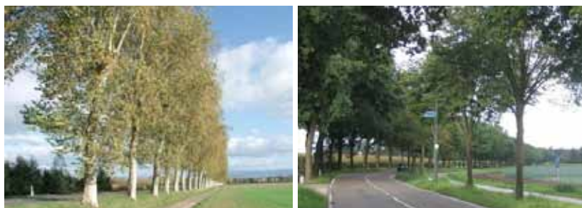
Ills. 89 and 90: Tracks running alongside the road, sheltered by the trees, can be used by cyclists or agricultural machinery

Transplantation is another option, providing this does not open the door to ill-considered projects which treat trees as objects that can be moved about at will. Making use of modern resources, this technique can be completely successful for some species and for trees with diameters of 40 to 50 cm – or even as much as 100 cm. Success depends on careful preparation and meticulous aftercare (watering in particular). The costs are much lower than the asset value of the trees, which would be negated altogether if the trees were felled.