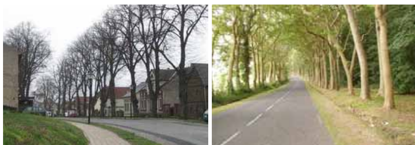
Ills. 60 and 61: The landscape is unified by the row of trees. Disparate buildings merge together behind the regular screen formed by the tree trunks; alternatively, the tree trunks stand out against the darker backdrop of the forest, creating a distinctive mellow effect

Rows of trees also provide a clue to reading the landscape. During the First World War, for example, tree-lined roads were a key feature in the iconography of the battlefields. On a more mundane level, the way trees are arranged and presented effectively signposts an urban environment or the approach to a built-up area: trees are more effective and attractive than other forms of signage.