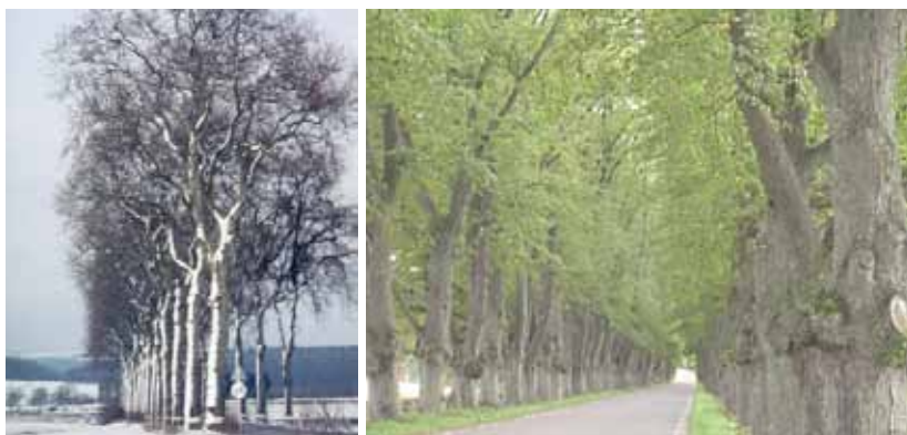
III. 50: A very old, majestic avenue of plane trees in Luxembourg. III. 51: The iconic allée at Övedskloster in Sweden. In 1776 Count Hans Ramel imported 4 000 lime trees to plant the roads of his estate

In fact, the road and the rows of trees accompanying it constitute an architectural feature, with a beginning and end, height, width, rhythm, proportions, and an arrangement that is a square or a quincunx. It is a living form of architecture, with the advantage over traditional architecture that it improves over time. Furthermore, the arch formed when the upper branches meet above the road is often described as a “green tunnel” or “archway”; the term “cathedral” is used in this connection as early as 1794. This description is all the more apt because the succession of trunks is naturally reminiscent of a colonnade and where the trees are planted in double rows the classically recommended proportions are the same as those for naves and side aisles. This kind of feature is architectural not only for its shape but also for the way light falls through it, creating a very distinctive ambience which changes with the passing hours and seasons.