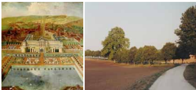
Ills. 117 and 118: In the background we see the avenue of lime trees which extends over more than 2 km in view of the Château de Commercy (France). It was planted around 1721 or 1750 and has been protected as an outstanding site since 1911. The ensemble, now partly located in an urban area, comprises nearly 500 trees, some of them more than a century old, and is regularly restored

Regulatory protection varies greatly from country to country. Some countries (France, Luxembourg, Latvia and Belgium, for example) protect double-row avenues, for example, if they are considered to be outstanding. This type of protection is based on classification, carried out on a voluntary basis or even with the landowners' agreement, with the result that the number of avenues protected varies and is limited overall (around 60 in Latvia, for example – but nearly 900 in just the Wallonia region of Belgium, which is one quarter the size).