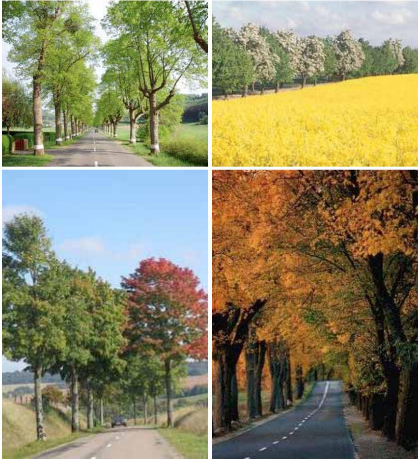
Ills. 9, 10, 11 and 12: The beauty of the spring landscape in Luxembourg and Sweden, with its mixed rows of chestnut and pear trees, is every bit as striking as the fiery autumn colours of tree-lined roads in France and Poland.

During his travels in France between 1787 and 1790, Arthur Young admired the French roads, as “much more like the well-kept alleys of a garden than a common highway” (Raffeau 1984). In 1802, Baron de Pradt expressed the view that “[tree] plantations ornament and honour a country. What more impressive and at the same time more agreeable sight can be offered to the traveller, be he foreign or even French, than these uninterrupted rows of trees which everywhere provide shelter from the sun’s heat and from blustery winds, presenting the road he travels on in the same form as the avenues in his garden” (Depradt 1802).