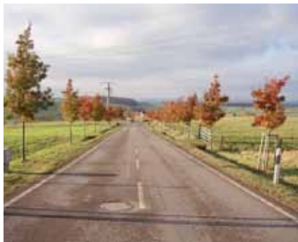
III. 102: Young pear trees spaced at distances gradually reducing from 15 m to 10 m to signal the approach towards a village