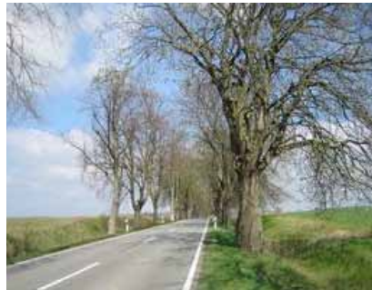
Ills. 37 and 38: Matching rows of planes in southern France and chestnut trees in Mecklenburg

Regional variations can be seen above all in the choice of species, which varies according to geography, climate and soil type as well as reflecting changing fashions. The choice also varies generally according to the type of feature involved: baroque allées , urban avenues, country roads, streets in garden cities, private avenues.