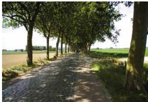
III. 85: Many country roads can cope with moderate levels of traffic, with features which are already sufficient for the purpose, as here in Sweden. III. 86: This photograph from the Dutch Crow guide No. 259, "Plattelandswegen mooi en veilig" [Roads in the open countryside: beautiful and safe], shows that sustaining trees and historic road surfaces is compatible with contemporary government and a policy of "sustainable safety". The use of different coloured paving stones creates the illusion that this is a single traffic lane, making users more vigilant and careful