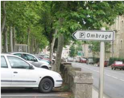
III. 66: The cooling effect of trees is estimated at 4°C to 10°C in a heatwave while some studies report an energy saving of 10% in the surrounding habitat. The sign in the photograph says “Shade”

With climate change and the decline of fossil fuels, trees' role in providing shelter from wind and sun is bound to attract increased interest. The process of evapotranspiration effectively makes them atmospheric air-conditioners, limiting the impact of extreme temperatures, while the Venturi effect operating between the ground and the tree's crown prevents snow drifts building up in the winter. Furthermore, roadside trees help reduce peak run-off flows, a vital factor; this also counters erosion and reduces the risk of landslides.