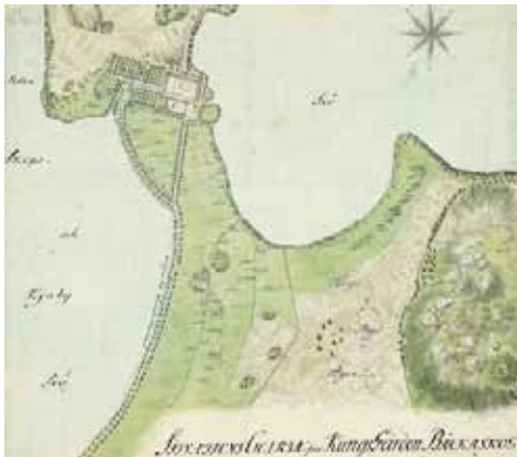
III. 1: Map of Bäckaskog Castle (Sweden) dating from 1773, showing all the tree-lined roads around the castle

The rows of trees we can still see today along some of Europe's roads and streets have a long and rich history. The earliest features of this type date back nearly 500 years. In our view, it is important to take account of this historical dimension – even though its treatment here is necessarily brief – because of the light it throws on the rich heritage that still survives in some regions of Europe.