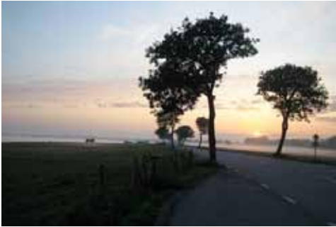
III. 32: Remnant of rows of Swedish whitebeams along a coast road in Scania (Sweden)