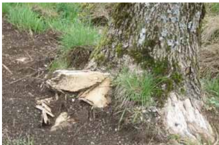
Ills. 27: Example of damage caused by shoulder grading works

Tree death can also be accelerated by chemical substances, particularly salt: salt used for snow clearing and to stabilise unsurfaced roads, as in Sweden, or brine and detergents discharged by market traders, as in France.