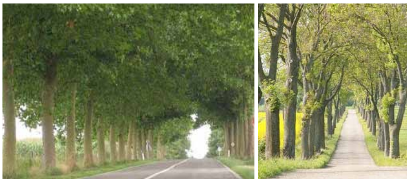
Ills. 52 and 53: Tunnel or cathedral? Tree-lined roads in Belgium and Poland (Warmia-Masuria)