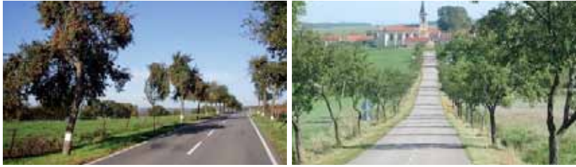
Ill. 43: Fruit tree planting was substantially expanded in Luxembourg in the 1870s. One of the aims was to combat alcoholism by producing cider. Ill. 44: Rows of mirabelle plum trees, traditionally identified with the Lorraine region of France