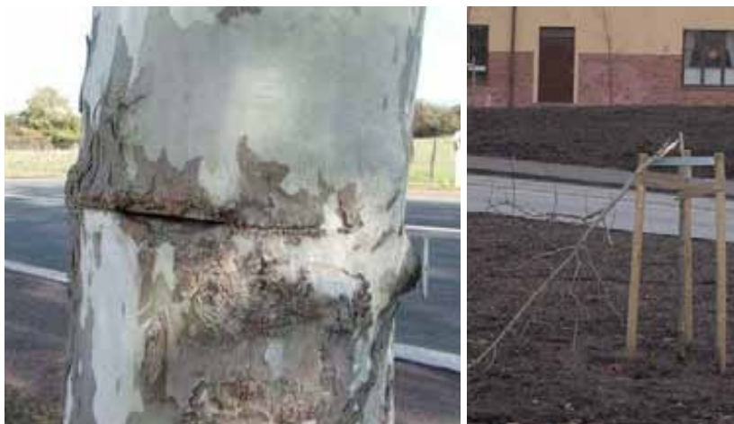
Ills. 28 and 29: Examples of vandalism in France and Sweden. In the Netherlands, a car dealer infuriated by the tree in front of his showroom resorted to poisoning; in Luxembourg, nearly 1 000 trees have been vandalised since 1994

Other attacks may be less obvious because they are less visible, but they are just as damaging, including asphyxiation caused by compacting the soil around the tree, and changes to its hydric environment. These conditions may arise when the water table is lowered, when leaks from underground pipe networks are repaired, when irrigation of neighbouring agricultural land is discontinued (as in the south of France), with embankment works – even temporary ones, and in particular when the level of the highway is altered.