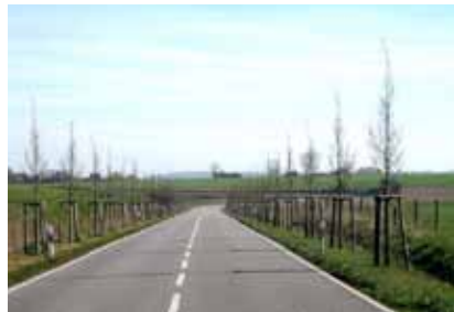
III. 98: A young plantation in Sweden. III. 99: This new plantation, extending over nearly 3 km, is made up of hornbeams planted close together and close to the road, already creating a visible “avenue” effect. The German state of Mecklenburg has lined 1 750 km of roads in this way since 1990