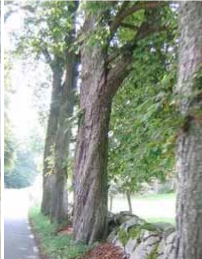
Ills. 19 and 20: Planting at a greater distance from the roadway requires difficult land acquisitions. Examples from France and Sweden