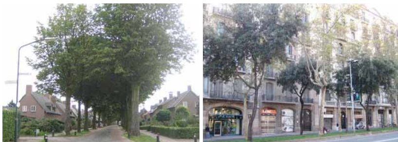
III. 48: An arrangement in the spirit of the Dutch Sustainable Safety programme: trees are used to keep pedestrian walkways separate from cars. III. 49: A double row on a central reservation in Barcelona

In fact, the road and the rows of trees accompanying it constitute an architectural feature, with a beginning and end, height, width, rhythm, proportions, and an arrangement that is a square or a quincunx. It is a living form of architecture, with the advantage over traditional architecture that it improves over time. Furthermore, the arch formed when the upper branches meet above the road is often described as a “green tunnel” or “archway”; the term “cathedral” is used in this connection as early as 1794. This description is all the more apt because the succession of trunks is naturally reminiscent of a colonnade and where the trees are planted in double rows the classically recommended proportions are the same as those for naves and side aisles. This kind of feature is architectural not only for its shape but also for the way light falls through it, creating a very distinctive ambience which changes with the passing hours and seasons.