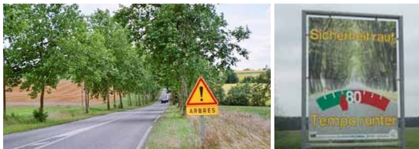
Ills. 80 and 81: Contrasting perceptions of road safety and aesthetics: in France, a sign tells drivers to beware of the trees; in Germany, an image highlighting the beauty of the preserved tree avenue invites drivers to opt for safety and decrease their speed

Conserving tree-lined roads calls for us to rethink road safety programmes in order to aim for individual prudence and responsibility. It means moving from “forgiving roadsides” – which absolve drivers of responsibility – to a concept of “calm driving”.