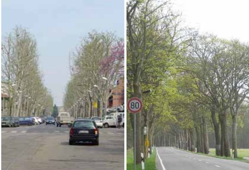
III. 76: An avenue of plane trees in Milan. III. 77: The Deutsche Alleenstraße running through Brandenburg

Trees of any sort have a positive impact on household consumption: research has demonstrated that holiday homes located in surroundings criss-crossed by trees have occupation rates 30% higher than those in open countryside, while household expenditure is 11% higher in shopping centres with trees.