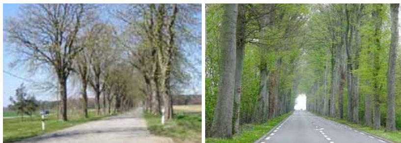
Ill. 87: This historic road in Mecklenburg, retaining its original paving and its trees, is used for local traffic. Through traffic has been diverted onto a new road which runs parallel to the old one (on the left in the photo). Ill. 88: On this route nationale (main road) in northern France, heavy goods vehicles travelling uphill use a parallel lane located beyond the avenue of tall beech trees

When traffic levels and the road's function require it, one potential solution is to create a new parallel roadway and to divert onto it all or part of the road's traffic (either traffic flowing in one direction or a particular type of vehicle).