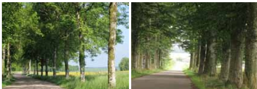
Ills. 58 and 59: The landscape is revealed in a succession of images or at the end of the avenue (France and Belgium)

Tree-lined roads also give shape to the landscape, creating sometimes a rhythmic effect, sometimes a unity. Travellers along a road lined with trees see the landscape as a dynamic succession of images framed by the tree trunks, which function as “windows” (another architectural term). The landscape is neither closed off (as it is by unbroken hedgerows) nor so wide open that the gaze gets lost in it: the space is framed and displayed to best effect.