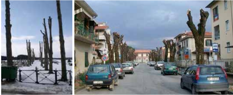
Ills. 25 and 26: These examples are from Poland and Italy. Ill. 25 shows another location where tree avenues were planted in the 19th century: cemeteries

D. Depradt (member of France's Constituent Assembly from 1789 to 1791) remarked: "There is nothing more pleasant and at the same time more impressive than a tree bearing all its branches, and there is nothing more unpleasant or perhaps more ridiculous than trees stripped of their branches; and yet the latter is the state in which they appear on some of the roads in France" (Depradt 1802).