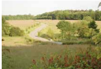
III. 96: This double row of wild cherry trees in France is about 20 years old. III. 97: Even though it is still young, this new plantation in Luxembourg already creates a presence in the landscape