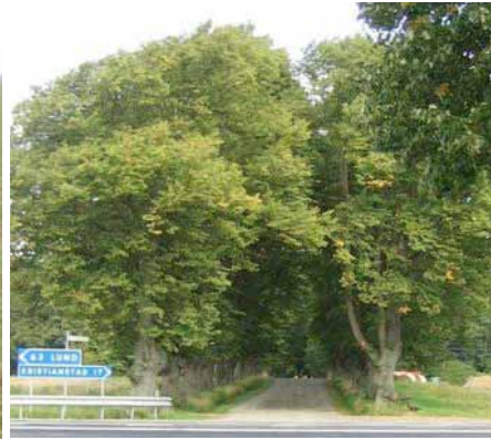
III. 106: Posts used to protect trees from damage in France. If the trees had been planted on the verge, between the roadway and the ditch, the risk of impact damage would have been minimised while at the same time restricting root growth in the direction of the cultivated land. III. 107: A strip of fallow land – here in Sweden – provides protection against impacts and soil compression