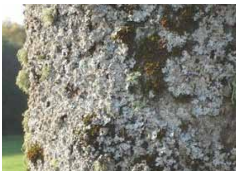
Ill. 67: Along unsurfaced pathways and roads, such as can be seen in Sweden and Latvia, for example, the dust that is stirred up encourages the formation of lichens which are endangered elsewhere

In urban environments where stone generally predominates over vegetation it goes without saying that tree-lined roads play a vital role for plant and animal life. Yet, their role is also a crucial one outside towns and cities. The lighting conditions they provide, a subtle mix of light and shade that is different from a forest, make them unique biotopes, even in woodland regions. When the trees remain by the roadside beyond the level of forestry maturity, they can develop their role in the landscape to the full, reaching ages which make them irreplaceable. As a result, they harbour many insects, providing unique hunting grounds for bats and birds and vital ecological corridors in open landscapes. Compared with roadside hedgerows, they have the advantage of encouraging birds and bats to fly higher when their paths cross roads, which stops them colliding with vehicles.