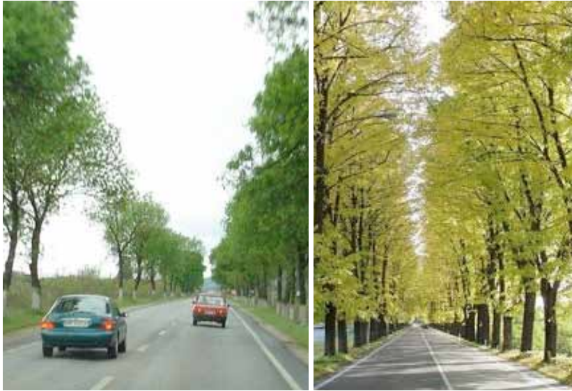
Ills. 33 and 34: Tree-lined roads in Romania and Italy