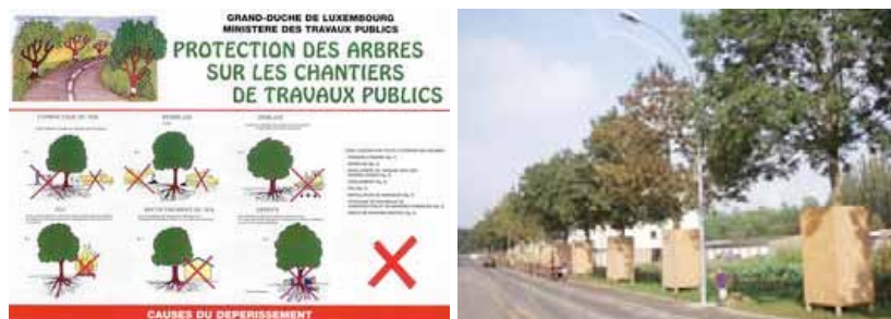
Ills. 103 and 104: In Luxembourg, posters are regularly supplied to companies and distributed on building sites. Specialist forestry officers act as consultants in the planning of roadworks

All excessive or over-vigorous pruning and tree topping must be outlawed, in favour of gentle pruning operations only, undertaken by trained arboriculturists who climb the trees. This technique, which is mandatory in some French départements and in Wallonia for outstanding tree rows, is the only way arboriculturists can enter the crown to remove dead wood and improve airflow among the upper branches, giving the tree improved transparency and greater stability in high winds. Special types of pruning may be practised if they reflect historic or local traditions, such as willow pollarding in south-east Sweden.