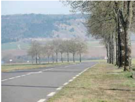
III. 13: In 1895, 87% of roads in the French département of Meuse were lined with trees on both sides: a total of 44 000 trees. Now just fragments of this heritage remain, comprising less than 7 000 trees in all

Comparing the former West Germany with the former East Germany, where the heritage was preserved for a long period, provides a striking illustration of the devastating effects of previous development policies: even though the west is 2.5 times larger, its tree-lined roads – those lined with trees on both sides – cover nearly five times less distance than those in the east (5 200 km compared with 23 000 km). In France, the département of Seine-et-Marne, even though it is one of the most aware of its heritage, now has less than one tenth (17 500) of the number of trees planted along its roads in the late 19th century (200 000).