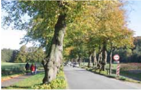
III. 105: This double row of trees from 1830 (Rathlousdals Allé in Denmark) borders a roadway that is 5.1 m wide, with traffic levels of 5 000 vehicles/day. It has been protected since 1979, and this is supplemented by a prohibition on winter salting, as is also the case in Freiburg in Germany. Elsewhere in Denmark screens are used to protect trees from the salt