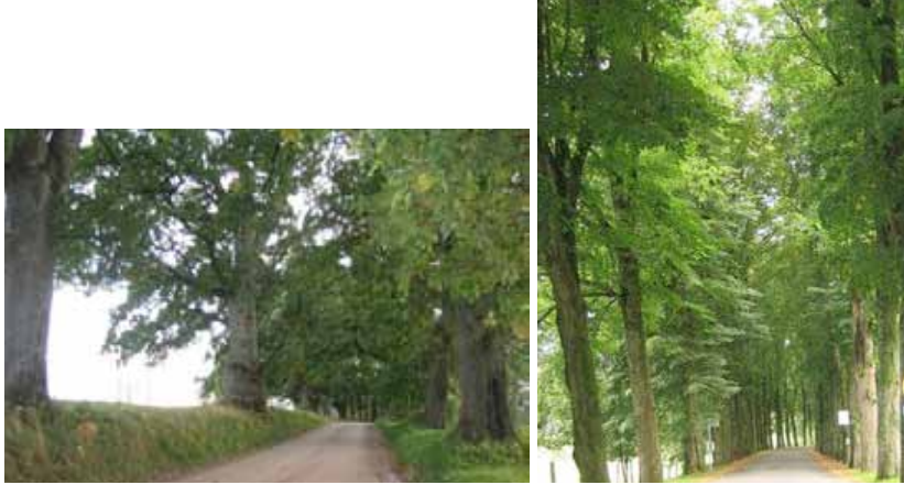
Ills. 119 and 120: Two tree-lined roads which have been designated as outstanding and protected, one in Latvia, the other in Belgium

the landscape. The federal states of Brandenburg, Mecklenburg, Schleswig-Holstein and Nordrhein-Westfalen have implemented similar government legislation.