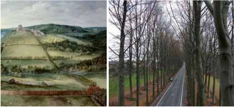
III. 4: This painting, View of the Château de Mariemont by Jan Brueghel the Elder (1612), shows Chaussée Brunehaut , a tree-lined avenue leading to the chateau. III. 5: Seven other hunting avenues were built on the estate including this one, which has survived through the centuries, becoming incorporated in the town as it has grown; it is known in Belgium as the “ Drève de Mariemont ”

Within towns and cities the appearance of tree-lined streets was driven by other changes. From the early 19th century, following the earlier example of St Petersburg, cities in Scandinavia – Helsinki in 1817 and Vänersborg in Sweden in 1834, for example – began to create wide thoroughfares which were planted with trees, the aim in this case being to prevent and limit the destruction caused by fires. In Paris, prefect Haussmann embarked on a programme of grand avenues, which came to be known as boulevards, on a scale more ambitious than anywhere in Europe except Vienna. In 1856 this programme was underpinned by an edict specifying the number of rows of trees to be planted according to the width of the roadway.