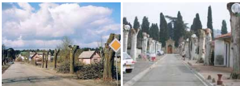
Ills. 23 and 24: Technically incorrect, aesthetically offensive. These recent examples from Latvia and France are just a very small sample of practices which ought to be banned

Incorrect pruning undertaken by staff lacking the necessary expertise is particularly symptomatic of this state of affairs. “Anyone can cut, but few know how to prune”, said Jean-Baptiste de La Quintinie, Louis XIV’s gardener. Sadly, his words still hold true today. Quite apart from the distressing visual results – diametrically opposed to the quest for beauty which inspired the planting of the trees in the first place – these expensive and inappropriate interventions can weaken the trees and lay them open to attack by pathogenic agents.