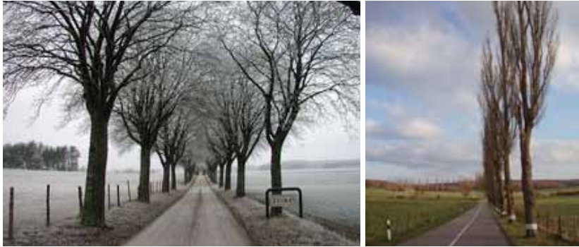
Ills. 39 and 40: Double row of Swedish whitebeams, fashionable in the south of the country in the early 20th century, and Lombardy poplars in Luxembourg

In 1766, Lombardy poplars were introduced to Leipzig, in Germany, from France; the first avenues were planted in Potsdam in 1770 and near Karlsruhe. The plane tree was introduced to Potsdam in 1797.