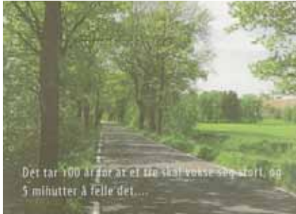
III. 84: This brochure from Norway's roads department reminds us that it takes 100 years to make a tree but just five minutes to cut it down