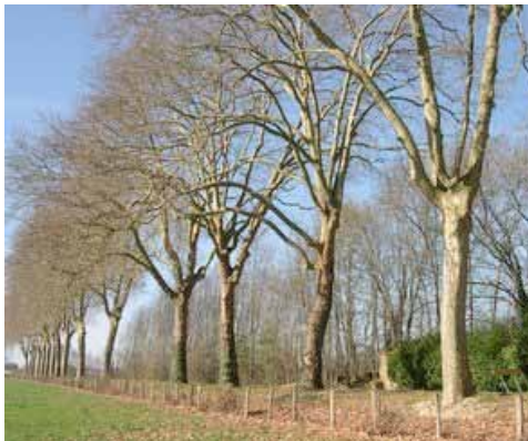
III. 114: Gentle pruning undertaken by professional climbing arboriculturists has two qualities: it preserves the tree's vitality and it is unobtrusive. It is a good idea to stage consciousness-raising tours for those in charge to ensure that this unobtrusiveness does not lead them to think they have spent money on "nothing"

Finally, raising public awareness is a key priority for the European Landscape Convention. This is a crucial issue for any landscape policy and consciousness-raising initiatives can take on an almost limitless array of forms. Germany and Sweden provide us with many examples.