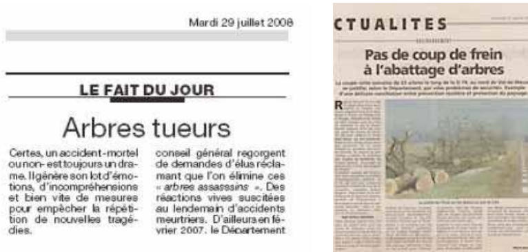
III. 16: Trees are still accused of being the cause of deaths on the roads and whole rows of them are being cut down, as evidenced by the titles of these recent newspaper articles: “The killing trees” and “No brake on tree felling”

The World Health Organization Report on Road Traffic Injury Prevention, referring to Sweden's Vision Zero, recommends the “systematic removal of roadside hazards, such as trees, utility poles and other solid objects” (WHO 2004). The disappearance of most roadside trees in Denmark resulted from the application of a ministerial circular to the same effect as early as 1952.