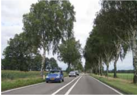
III. 116: Roadside trees are not just for small country roads. This avenue is in the Netherlands