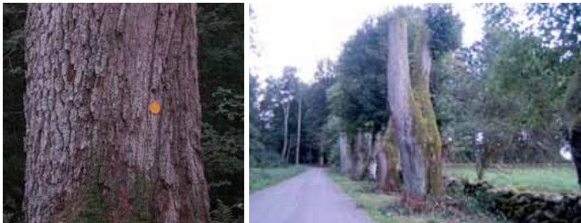
Ills. 121 and 122: The yellow mark on a tree in Sweden means that it is especially valuable in terms of biodiversity. Here, the trunks have been kept in place but they could have been moved to a nearby location as is done in some cases

The scope of the protection provided is key to assessing the effectiveness of these regulations: for example, while Wallonia, Sweden and Mecklenburg all protect both single- and double-row avenues, single rows are excluded from the protection provided in Brandenburg.