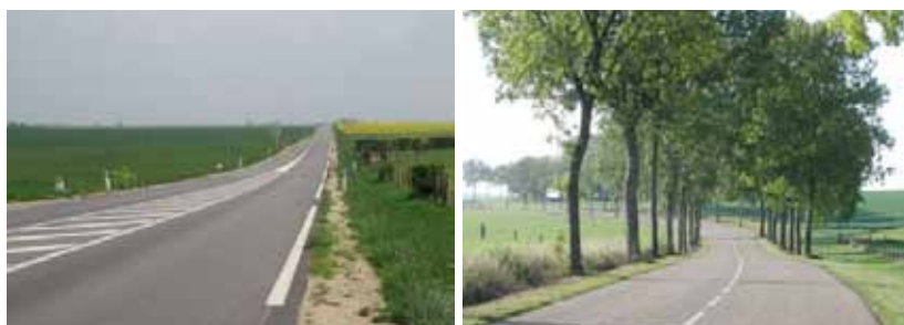
Ills. 74 and 75: Two philosophies of travel – one mechanistic, the other hedonist

Tourism also benefits. At the other end of the spectrum from “Vision Zero”-style roads, where drivers are interested in nothing except arriving at their destination and getting there within a particular time, with no room for any emotional response, tree-lined roads extend an invitation to explore and discover the countryside they cross: in this respect they enhance the area’s attractiveness.