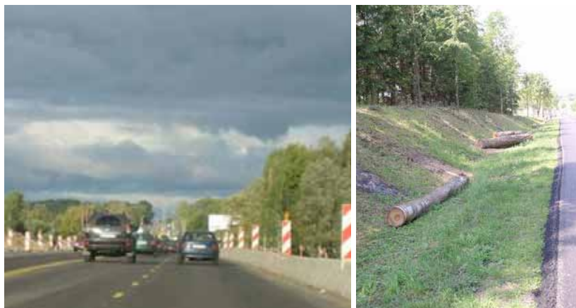
III. 14: Road widening works on the outskirts of Riga. III. 15: Tree felling in Masuria, Poland

In 1972, France recorded 16 545 deaths on the road. The total in 2007 was 4 620: down by two thirds. In Germany, the number of people killed on the roads in the federal state of Mecklenburg-Western Pomerania 7 fell from 624 in 1991 to 144 in 2007 (a decrease of 77%).