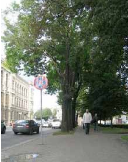
III. 18: Riga, a “green city”, with a large number of trees which require constant vigilance, as in forest regions

cases going back to the 1980s or 1990s. Yet, where these features are not endangered by the pressure on land availability, the trees are often disregarded during real-estate or infrastructure projects and totally neglected while the works are under way, resulting in unnecessary loss through felling or tree death.