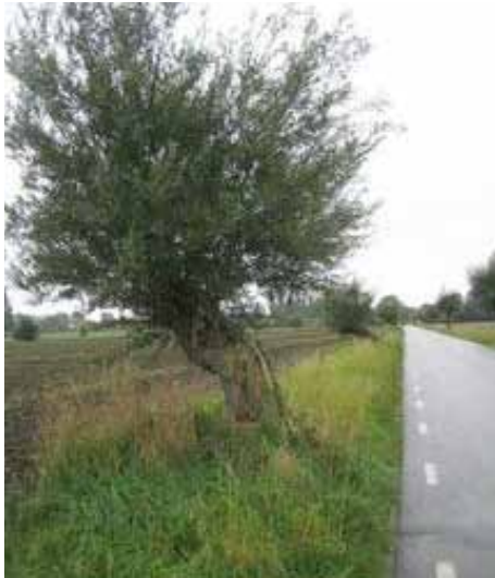
III. 8: Sweden's willows supplied firewood, fodder and wood for fences

For Chaumont de la Millière, responsible for the administration of French roads between 1781 and 1792, tree planting along roadways was vital because the scarcity of wood was “beginning to cause concern which is all too well founded” (Reverdy 1997). By 1789, the shortage of firewood was beginning to make itself felt, its price having more than doubled in 20 years.