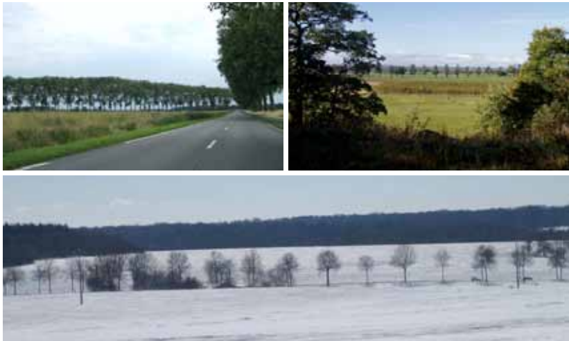
Ills. 45, 46 and 47: A distinctive presence in French and Swedish landscapes

In other words, tree-lined roads structure the space of a landscape. This is true of the countryside, but it is particularly evident in towns, where the volumes created vary according to the shape of the trees selected and the way they are arranged – in the middle of the roadway or to the sides, for example.