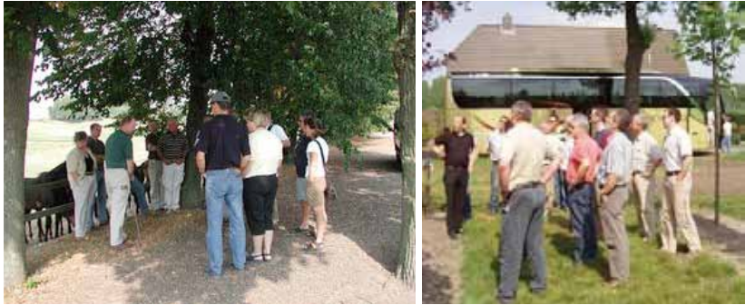
III. 112: In Sweden, training courses covering historical, biological and technical issues have been provided since 1996 for private landowners, many of them farmers, and for the roads department, which invites businesses to take part. III. 113: Nursery tour organised for road specialists and public officials in Luxembourg

know-how on the part of many workers and third parties on the ground. Caring for trees is a profession in its own right, it is not something you can make up as you go along: all works programmes must be sensitively carried out by personnel with the appropriate training. It is the decision makers' duty to recognise these requirements and act upon them. This sector also represents a major source of skilled employment for the local workforce.