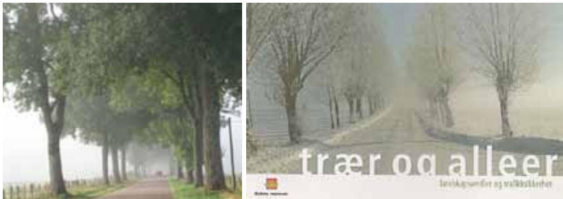
Ill. 72: In fog, when there are no road markings, trees provide valuable assistance. Ill. 73: Norway's roads department highlights the vital role played by tree avenues in a country with snowy winters

The trees filing past help drivers maintain awareness of their speed without looking at their speedometer. By channelling lateral vision they also encourage prudence, whereas an open roadway reduces vigilance and encourages speed. Finally, it should be noted that research has demonstrated a link between the beauty of a road and higher levels of road safety.