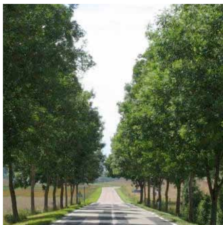
III. 108: Tree-lined roads in France do not benefit from general protection. The result is clear: two départements, two different approaches. After the tree felling of the 1990s a tree avenue which once lined the whole road now stops at the “border”

Is it enough to know that trees should not be cut down, and that we need to plant, manage, communicate and promote road safety in order to ensure that this heritage survives? Can the future of tree-lined roads depend solely on the goodwill, cultural sensitivity and commitment of managers or elected officers whose career paths and mandates obey timescales very different to the lifespan of these trees themselves? Should this future be dictated, ad hoc, by changing pressures and requirements even though we know that a tree cannot be “rebuilt” – unlike buildings, which may at times have been saved from disappearing altogether in this way?