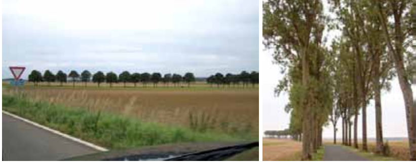
Ills. 70 and 71: The intersection and the bend in the road are clearly visible from afar

Rows of trees along a road contribute to safety by signalling bends, crossroads and the approach to built-up areas more effectively than road signs. They make it easier for drivers to read the road ahead, a key factor in helping them anticipate and adapt their driving to their environment, both in normal weather and even more so in snow or fog, or at night.