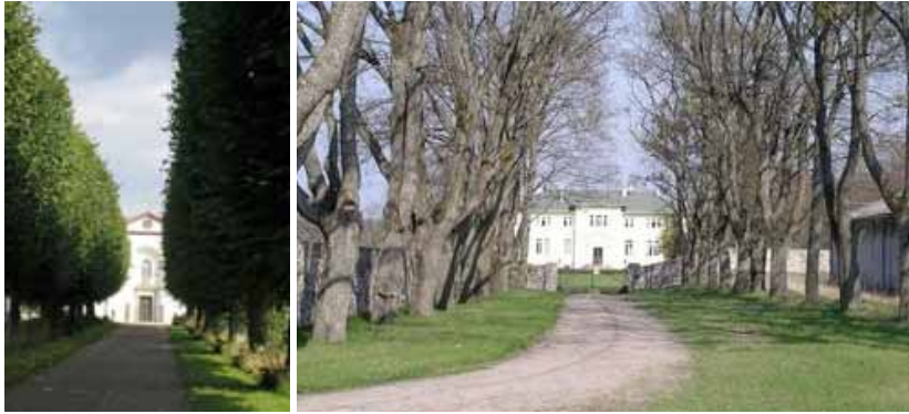
III. 2: One of the many avenues in the grounds of Övedskloster Castle leads towards the church. The clipped style of pruning, which is rare in Sweden, retains the view of the church, accentuating the formal qualities of the design. III. 3: Avenue leading to the castle at Gasiorowo, in the Polish county of Olsztyn