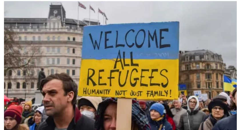
Demonstrators gather in support of Ukraine in London's Trafalgar Square