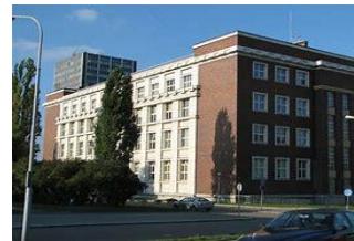
BRNO LAW FACULTY