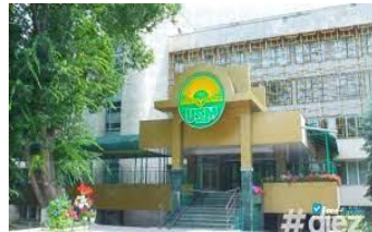
MOLDOVA STATE UNI