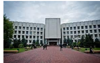
INSTITUTE OF INT'L RELATIONS KYIV TARAS SHEVCHENKO