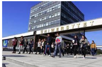
Nicolaus Copernicus University Poland