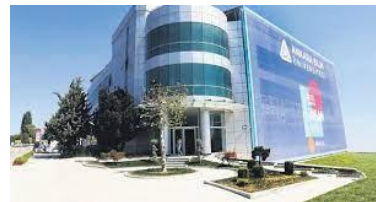
Ankara science University