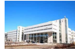
University of Jyväskylä (Finland)