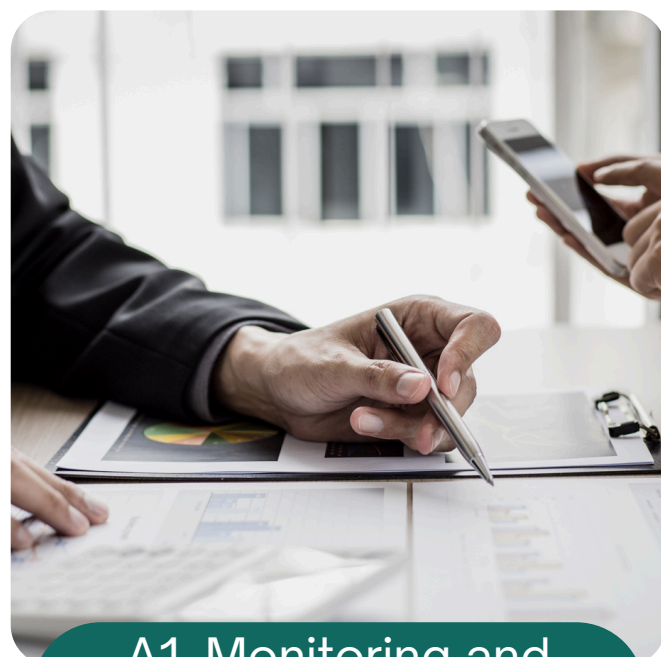
A1. Monitoring and evaluation

The project partners held numerous project meetings, to keep flow of the communications, to guarantee an efficient exchange of information to ensure the correct planning and realization of the activities, the monitoring of the expenses and a continuous reporting (both narrative and financial), to make any needed adjustment. The activity includes the administrative requirements and procedures to assure the principles of impartiality, transparency, publicity, effectiveness, economy. The activity involved both Municipalities of the Consortium, but also single Municipality's stakeholder and partners.