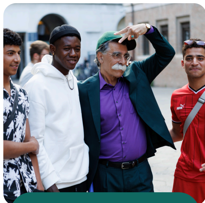
A2. Study visit in Ravenna

Participation of Municipality of Montesilvano's officials and UFM's hosted in Montesilvano in a study visit in Ravenna (23-26 May 2024).