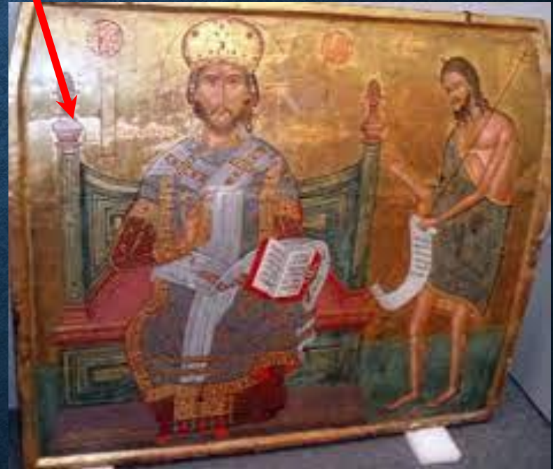
TWO ICONS FROM THE CHURCH OF AGIOS IAKOVOS IN TRIKOMO VILLAGE IN OCCUPIED CYPRUS. REPATRIATED FROM SWITZERLAND.