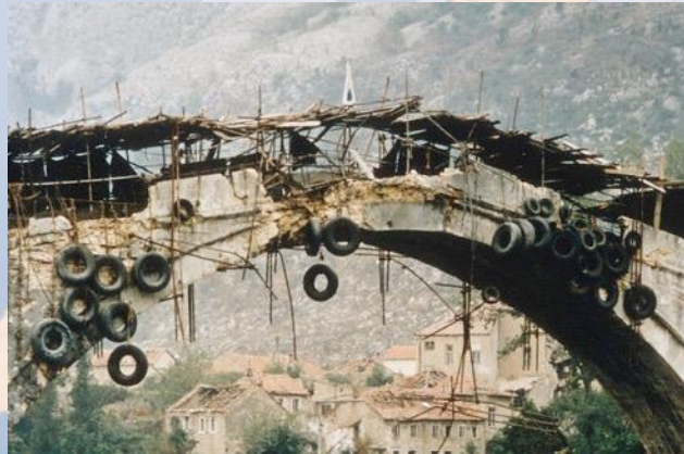
Stari Most Mostar, 1993