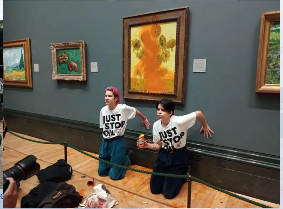
Climate Protest, 2022, London

E.C.C.O. - European Confederation of Conservator-restorers' Organisations