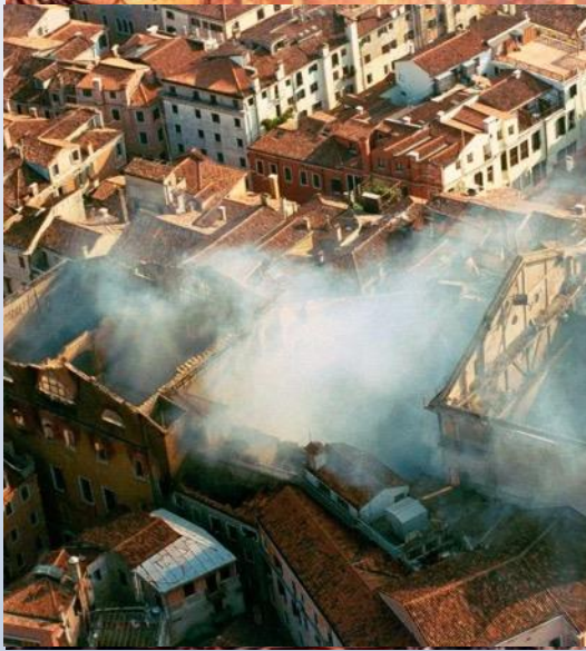
Theater, La Fenice, Venice, 1996: a