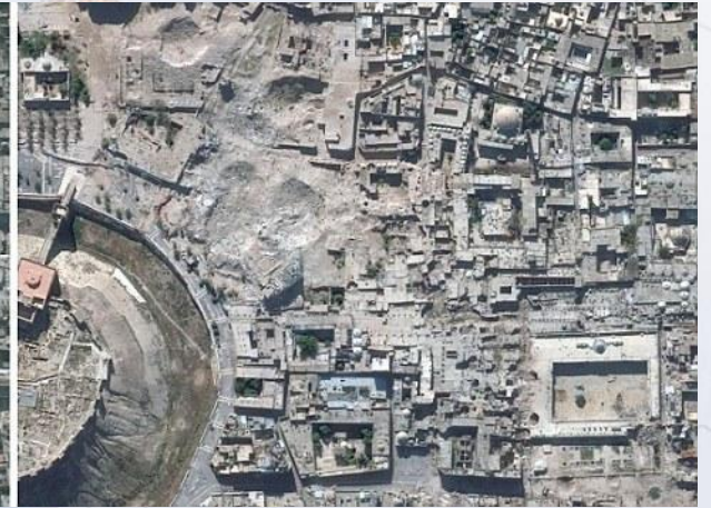
Aleppo, since 2011