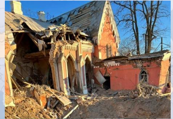
Ukraine, since 2022

E.C.C.O. - European Confederation of Conservator-restorers' Organisations