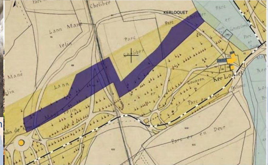
Menhirs du chemin, Carnac, 2023: building project