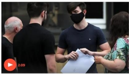
▲ 'I put my heart and soul into them': A-level students on downgraded results – video repo

Teachers in England had nearly 40% of their A-level assessments downgraded by the exam regulator's algorithm, according to official figures published on Thursday morning as sixth-formers around the UK received their results.