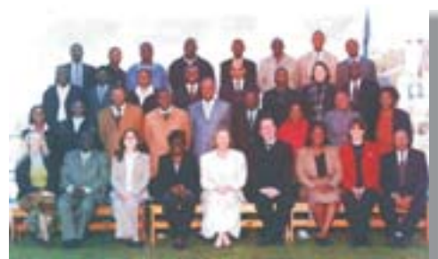
Participants in the International Criminal Court Course, Cape Town, June 2004