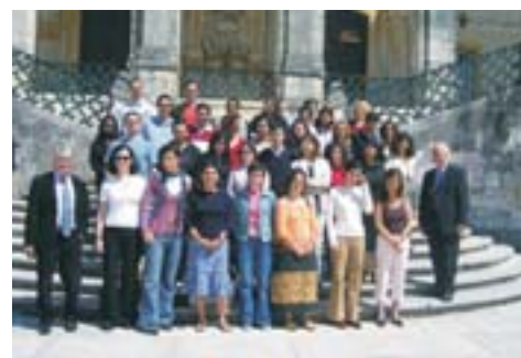
Group course at the Centro de Direitos Humanos, Ius Genitum Conimbrigae

associated group of 29 Universities across the European Union, as well as an autonomous post-graduation course for other participants. With working languages of both English and Portuguese, the course is characterised by its multidisciplinary approach to the issues of human rights.