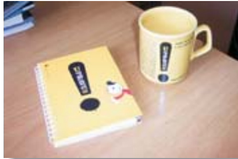
“You have right!”

the promotion of the ideas of democracy, equality