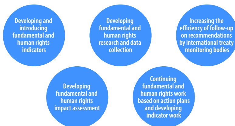
Figure 2. Measures of the National Action Plan on Fundamental and Human Rights.

The competence of law drafters in fundamental and human rights issues will be strengthened and support for fundamental and human rights impact assessments of legislative proposals will be increased (section 3.4). Fundamental and human rights work, including the development of indicators, based on action plans must also be continued during future government terms (section 3.5).