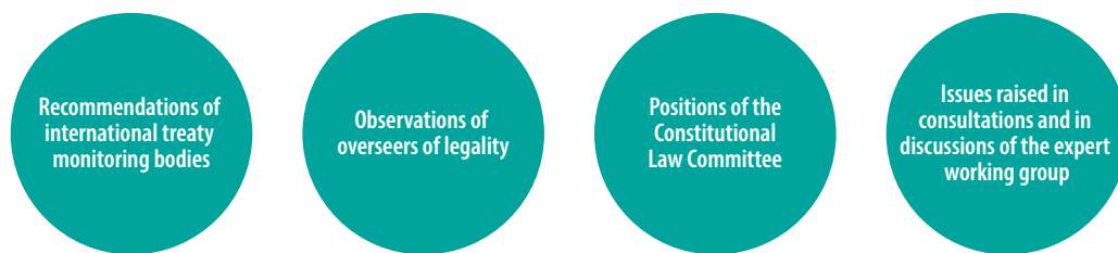
Figure 3. Main selection criteria for the monitoring indicators.

The aim is to develop and supplement the contents of the indicator framework in the future as well, to reflect developments in the indicator knowledge base or in the operational context. The expert working group appointed for the preparation of the National Action Plan on Fundamental and Human rights will continue its work until the end of 2023 and contribute towards the development of the work on indicators. For the implementation of the indicator framework, a public, accessible website will be set up, making available not only the framework but also information about the backgrounds and data sources of the indicators and links to other indicator-related work on action plans and strategies. Also due for completion by the end of 2023 is the first monitoring round reporting on the realisation of the rights reflected by the indicators on the basis of the knowledge base available. It is important to ensure in conjunction with the monitoring round that there are sufficient competences and resources available for the interpretation and analysis of the indicators and their underlying data sources as well as for drawing conclusions. The first monitoring round will include, where necessary, separate reports on the situational picture concerning the fundamental and human rights issues included in the indicator framework to strengthen the knowledge base.